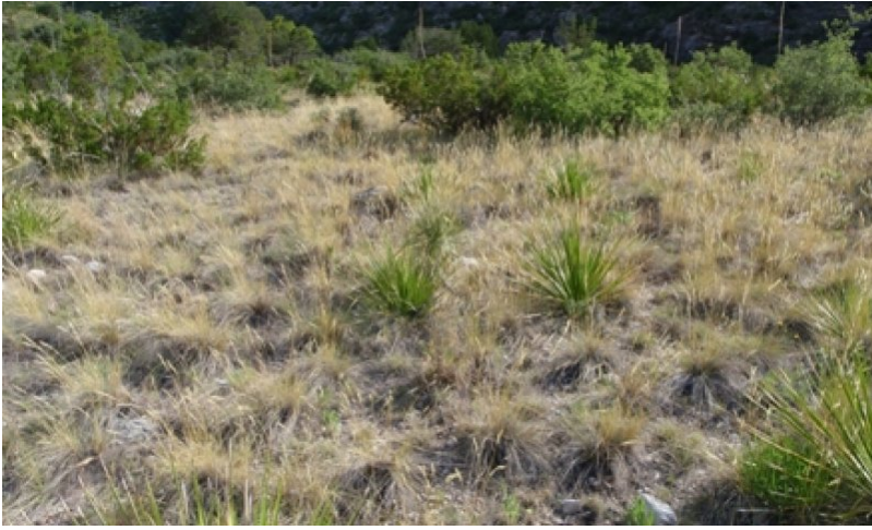
Figure 7. 1.2 Cool-season Grasses/Shrubs/Trees Community

New Mexico feathergrass, a cool-season grass dominates the herbaceous layer. Other cool-season grasses present in the plant community such as southwestern needlegrass may also increase. Warm-season grasses such as curlyleaf muhly, black grama, and blue grama occur as subdominants.