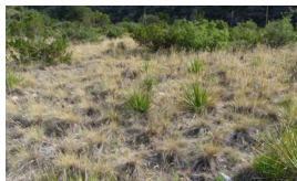
Cool-season Grasses/Shrubs/Trees Community

Above average cool-season precipitation and rainfall events will cause a shift from a warm-season grass community to a cool-season dominated grass community.