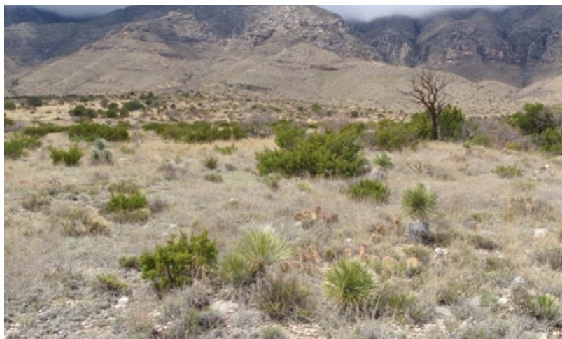
Figure 4. 1.1 Midgrass/Shrubs/Trees Community

This community phase is the reference plant community. Curlyleaf muhly, black grama, and blue grama are common grasses. Common shrubs include redberry juniper, skunkbush sumac, wavyleaf oak, and sacahuista. Pinyon pine occurs as a minor component. Annual production ranges from 410 to 1010 pounds per acre. Conservation practices such as prescribed fire and/or prescribed grazing can help maintain this plant community with a diverse mix of species. Lack of any disturbance overtime may favor more dominant plant life forms or particular species.