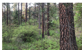
Mature Ponderosa pine Woodland