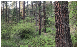
Mature Ponderosa pine Woodland