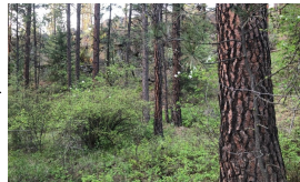
Mature Ponderosa pine Woodland

Intense site preparation to kill cool season introduced grasses. Native shrub and grass seeding needed if native vegetation is sparse.