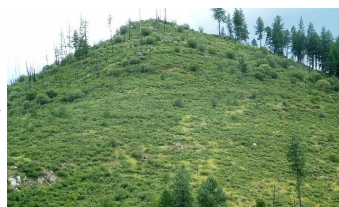
Stand (Replacement) Initiation