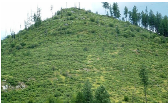
Stand (Replacement) Initiation