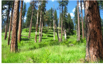
Reference Plant Community