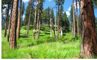
Reference Plant Community

Time. Low severity ground fires every 10-20 years to create patchy open grown ponderosa pine and Douglas-fir with grass dominant