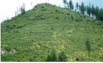
Stand (Replacement) Initiation