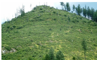
Stand (Replacement) Initiation