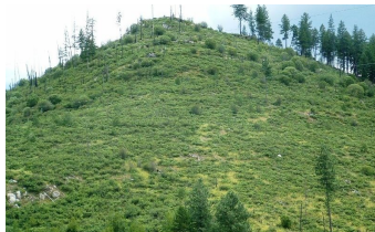
Stand (Replacement) Initiation

Stand replacement disturbance. Severe Fire or insect mortality killing large pine/fir