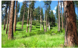
Reference Plant Community

Time. Low severity ground fires every 10-20 years to create patchy open grown ponderosa pine and Douglas-fir with grass dominant