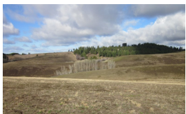
Conversion to Cropland or Pasture