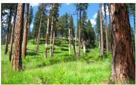
Reference Plant Community