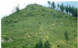
Stand (Replacement) Initiation