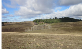
Conversion to Cropland or Pasture

Forest stands converted to cropland or pastureland