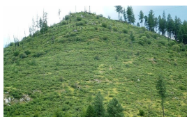
Stand (Replacement) Initiation

Stand replacement disturbance. Severe Fire or insect mortality killing large pine/fir.