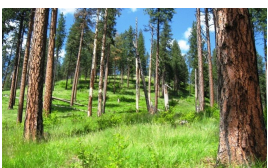
Reference Plant Community