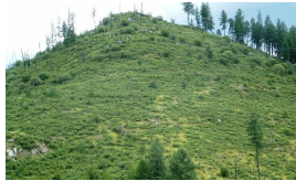
Stand (Replacement) Initiation

Stand replacement disturbance. Severe fire back to grass/shrub stage with periodic natural tree regeneration