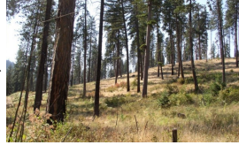
Reference Plant Community – Open Stand

Fire at 10 – 15 year intervals keep stand in open condition.