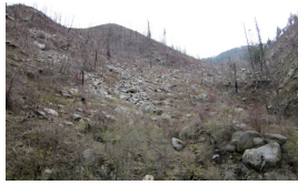
Reference Plant Community – Open Stand