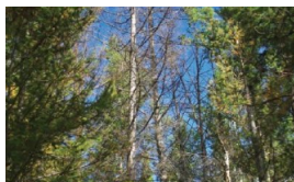
Root Rot Sites

Root rot pockets killing DF and GF creating a deciduous vegetation state