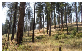
Reference Plant Community – Open Stand

Mixed severity and/or frequent low ground fires open up stand.