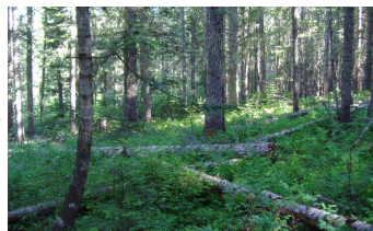
Mixed Species Stand

Time, allowing stands to reach maturity before a stand replacing fire. Mixed severity fires then occur.