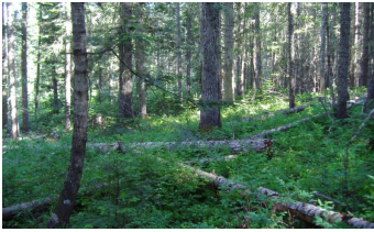
Mixed Species Stand