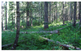
Mixed Species Stand

Time, allowing stands to reach maturity before a stand replacing fire. Mixed severity fires then occur.