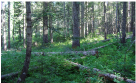
Mixed Species Stand