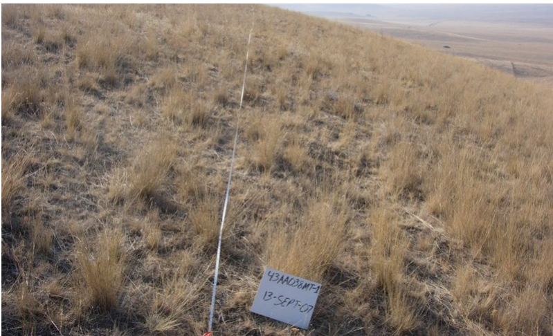
Figure 7. 43AA Droughty Steep 1