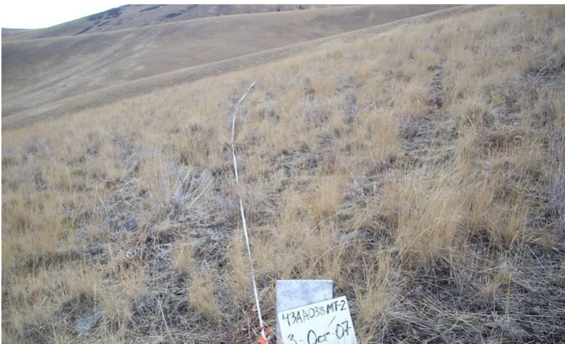
Figure 8. 43AA Droughty Steep 2

The Bluebunch Wheatgrass Community (1.1) is dominated by bluebunch wheatgrass, a taller cool-season bunchgrass with a minor component of forbs and low-growing shrubs. Bluebunch wheatgrass is typically the dominant species in the Bluebunch Wheatgrass Community (1.1). Rough fescue ( Festuca campestris ) occurs in the reference community in the more mesic portion of the LRU, increasing to approximately 20% of species composition by dry weight in the wetter end of the LRU. Needleandthread, Idaho fescue ( Festuca Idahoensis ), Sandberg bluegrass ( Poa secunda ), and prairie junegrass ( Koeleria macrantha ) are subdominant. Many common forb species exist on this site, including arrowleaf balsamroot ( Balsamorhiza sagittata ). Low-growing shrub species, including fringed sagewort ( Artemisia frigida ), are present as a minor part of the community. The Taller Bunchgrass State generally occurs on the Droughty Steep site in areas where proper grazing management practices have been implemented over a long period. The Bluebunch Wheatgrass Community can be maintained through the implementation of properly managed grazing that provides adequate growing-season deferment to allow establishment of taller grass propagules and/or the recovery of vigor of stressed plants. The Bluebunch Wheatgrass