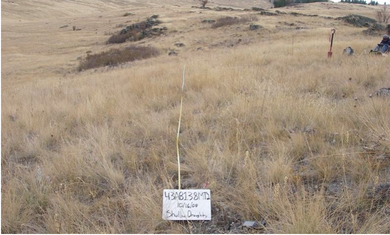
Figure 4. 43AB Shallow Droughty 1