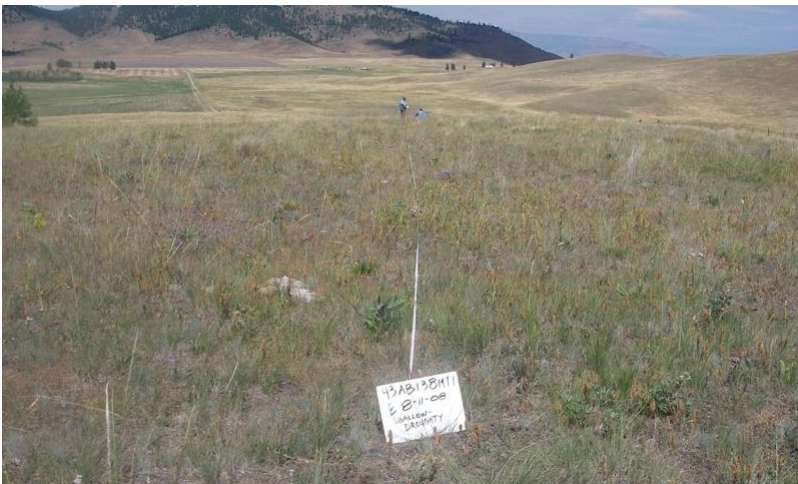
Figure 5. 43AB Shallow Droughty 2