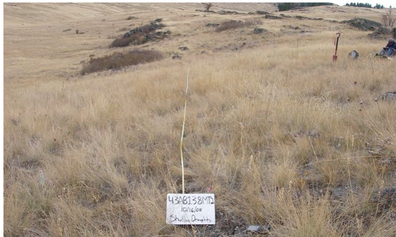
Figure 4. 43AB Shallow Droughty 1