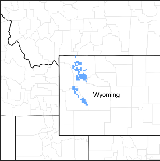
Figure 1. Mapped extent

Provisional. A provisional ecological site description has undergone quality control and quality assurance review. It contains a working state and transition model and enough information to identify the ecological site.