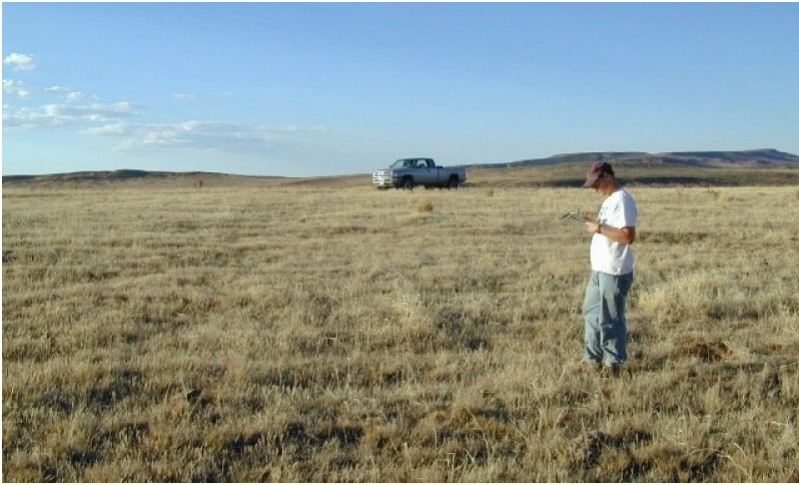
Figure 12. R047XA308UT Upland Loam (Basin big sagebrush) community 4.1 Introduced perennial bunchgrass. Cover is 30% grasses, 25% forbs, 0% shrubs, 20% bare ground and 25% litter.

This plant community is predominantly a monoculture of a seeded species, commonly crested wheatgrass ( Agropyron cristatum ).