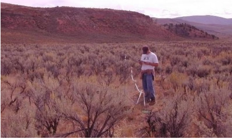
Figure 10. R047XA308UT Upland Loam (Basin big sagebrush) community 2.1 Basin Big Sagebrush/ Introduced Non-native Herbs State. Basin big sagebrush dominates the overstory and an unknown grass dominates the understory.

This plant community will develop in the absence of fire and is characterized by basin big sagebrush with an understory made up of both native perennial and introduced herbs. Bunchgrasses include bluebunch wheatgrass, needle-and-thread, Indian ricegrass, and basin wildrye. Forbs include buckwheat, tapertip hawksbeard, arrowleaf balsamroot, western stoneseed, and longleaf phlox. Common invaders are cheatgrass and Russian thistle.