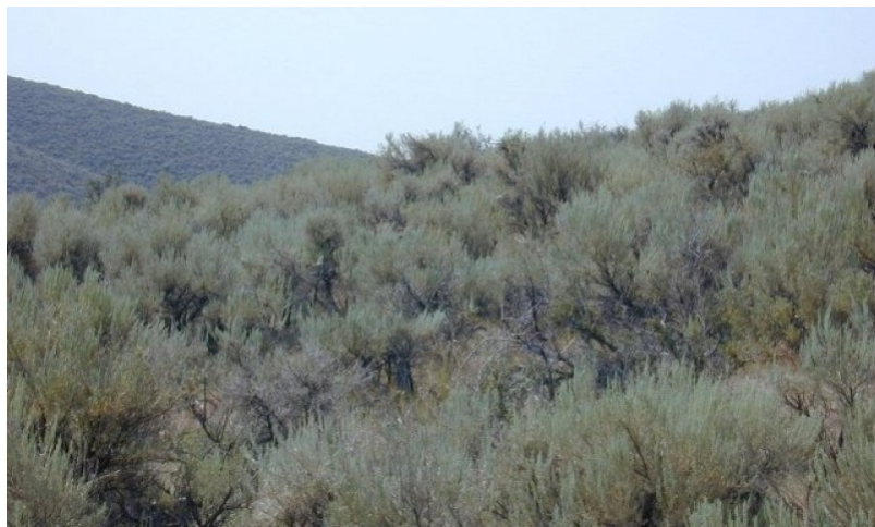
Figure 11. R047XA308UT Upland Loam (Basin big sagebrush) community 3.1 Basin big sagebrush super-dominance. Basin big sagebrush dominates the overstory and Cheatgrass dominates the understory.

This plant community is characterized as a basin big sagebrush-dominated site where the understory is greatly diminished in species richness and abundance from heavy continuous livestock grazing and lack of fire.