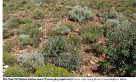
Rabbitbrush / Perennial Grass

This pathway occurs as fire or other shrub-removal disturbance (drought, herbivory, etc.) removes Wyoming big sagebrush from the plant community. Historic fire regime is expected to have been patchy, mixed-severity fires that occurred ever 10 to 70 years (Howard 1999). This pathway occurs when phase 2.1 has a significant amount of sprouting shrubs in the community, and results in a community co-dominated by perennial bunchgrasses and sprouting shrubs, most commonly yellow rabbitbrush. This pathway may result in an increase in annual non-native species.