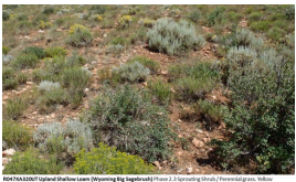
Rabbitbrush / Perennial Grass