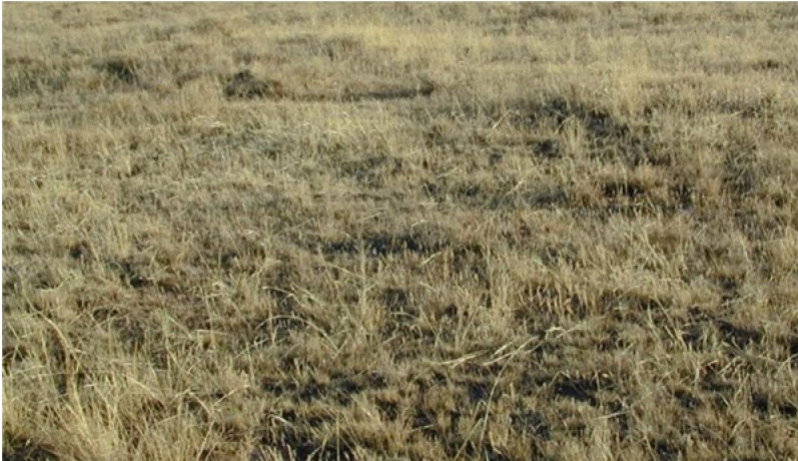
Figure 21. Phase 4.1

GAP Analysis Project, RS/GIS Laboratory, USU.