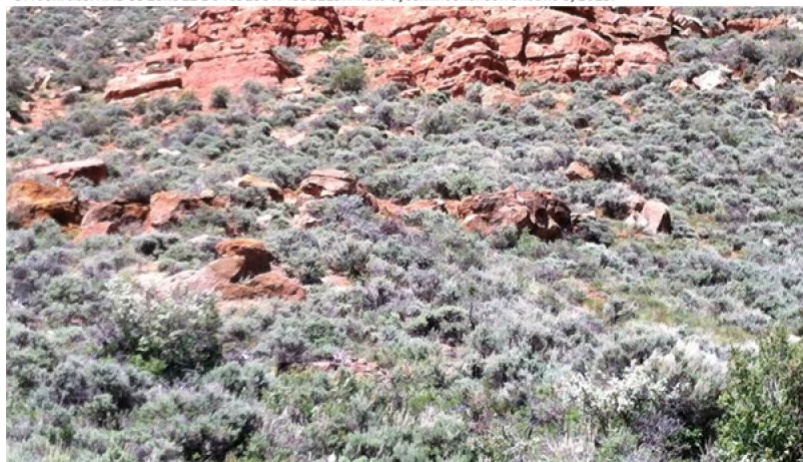
Figure 9. Phase 1.1

57% shrubs. NAD 83 Zone 12 E 0469130N 4592115. Photo by Jamin Johanson on June 3, 2013.