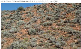
Wyoming Big Sagebrush / Perennial Grass