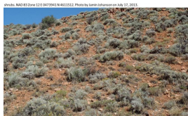
Wyoming Big Sagebrush / Perennial Grass