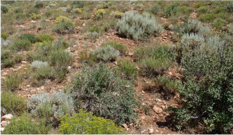
R047XA320UT Upland Shallow Loam (Wyoming Big Sagebrush) Phase 2.3 Sprouting Shrub / Perennial grass. Yellow