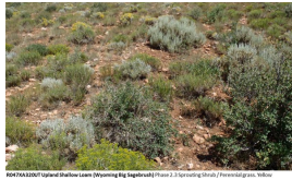
Rabbitbrush / Perennial Grass

This pathway is expected to occur when perennial grasslands experience an increase in sprouting shrubs, possibly due to repeated fires over a short time period. This pathway may also result in an increase in non-native annual plants.