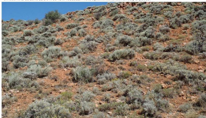
Figure 13. Phase 2.1

shrubs. NAD 83 Zone 12 E 0473941 N 4611512. Photo by Jamin Johanson on July 17, 2013.