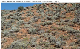
Wyoming Big Sagebrush / Perennial Grass

This pathway occurs as Wyoming big sagebrush slowly increases in the plant community following fire or other shrub-removal events. It may take 10 to 40 years for sagebrush to regain dominance in the community, depending on subsequent weather events and distance to sagebrush seed source. The resulting community is co-dominated by sagebrush and perennial bunchgrasses.