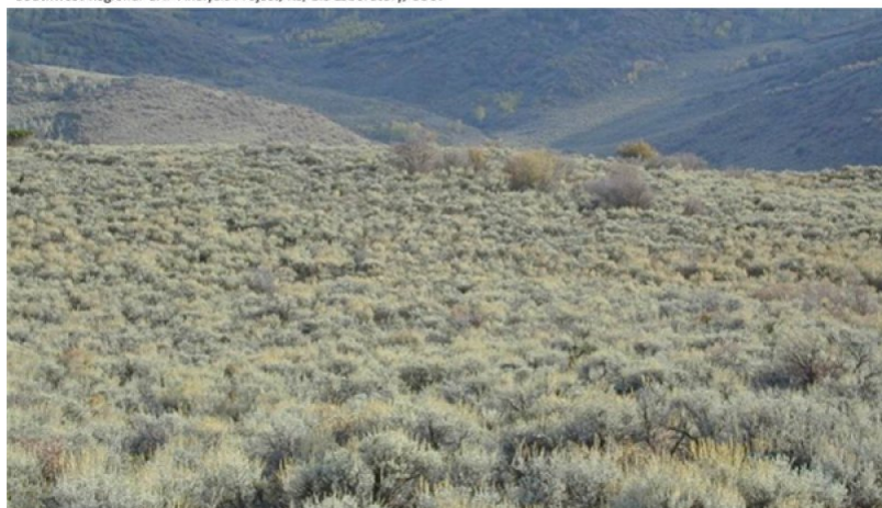
Figure 19. Phase 3.1

Southwest Regional GAP Analysis Project, RS/GIS Laboratory, USU.