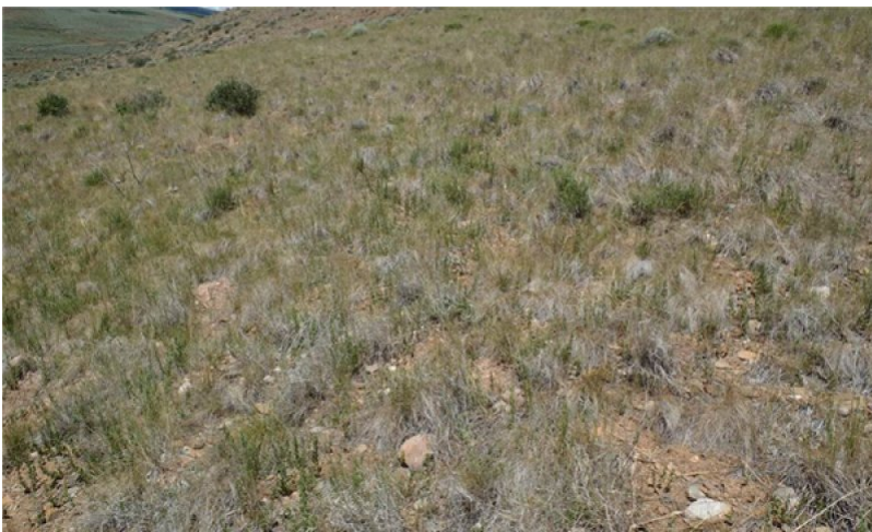
Figure 15. Phase 2.2

The perennial grassland community is dominated by bluebunch wheatgrass and Idaho fescue. Diverse perennial grasses and forbs are also abundant in the plant community. Sprouting shrubs may be present in small numbers, but are not abundant in this community phase. Wyoming big sagebrush has been removed from the plant community, but may also be present (not dominant) due to natural succession as it slowly increases in the community following removal. Non-native species are present but not dominant. Composition by air-dry weight is 50 to 90 percent grasses, 10 to 20 percent forbs, and 0 to 35 percent shrubs.