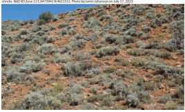
Wyoming Big Sagebrush / Perennial Grass