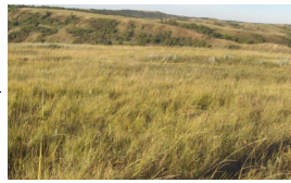
Western Wheatgrass/ Green Needlegrass

This community pathway is initiated by implementation of prescribed grazing management which includes adequate recovery periods following each grazing event, and stocking levels which match the available resources. If properly implemented, this will shift the competitive advantage from the introduced cool-season species to the native cool-season bunchgrasses. The addition of prescribed burning may expedite this shift. As this pathway continues, the change in composition and distribution of the plant community will increase infiltration and reduce runoff.