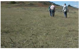
Western Wheatgrass/Blue Grass/Sedge/Sagewort