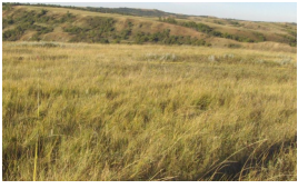
Western Wheatgrass/ Green Needlegrass