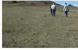
Western Wheatgrass/Blue Grass/Sedge/Sagewort

Several combinations of events can occur to initiate this pathway. Continuous, heavy season-long grazing or heavy seasonal grazing will favor the shift to sod forming grasses and sedges. Along this pathway, the timing of energy capture shifts from spring and early summer to early spring and mid summer. The change in plant functional and structural groups and the composition and distribution of the vegetation causes a decrease in production and an increase in runoff with a corresponding decrease in infiltration. Nutrient cycling is restricted as the rooting depth of the vegetation decreases with the change in functional and structural groups. Plant community diversity is reduced with a loss of leguminous forbs and minor grass components.