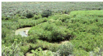
Figure 2. 58AC Riparian Subirrigated 11-14" MAP Plant Commun