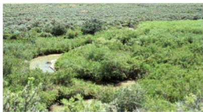
Figure 2. 58AC Riparian Subirrigated 11-14" MAP Plant Commun