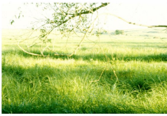
Prairie Cordgrass- Reedgrass/Sedge