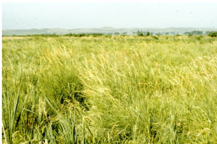
Figure 13. Plant Community Phase 1.2

This plant community occurs during the wetter precipitation/hydrology cycles that naturally occur on this site. During these periods, the species composition shifts to domination by the grass-like species. The plant community is made up of about 10 to 35 percent grasses, 40 to 60 percent grass-likes, 15 to 35 percent forbs, and 0 to 5 percent shrubs and/or trees. Dominant species include bulrush, Baltic rush, spikerush, and cattail.