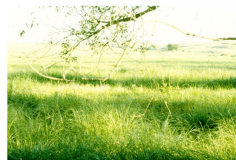
Prairie Cordgrass- Reedgrass/Sedge

Prescribed grazing that provided change in season of use and adequate recovery time and/or a return to a normal or slightly drier precipitation/hydrologic cycle will shift this plant community to the Prairie Cordgrass-Reedgrass/Sedge Plant Community.