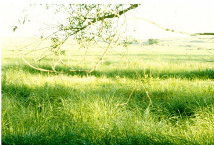
Figure 10. Plant Community Phase 1.1

This plant community occurs during the more normal to drier precipitation/hydrology cycles. During these periods, grasses become more dominant in the plant community.