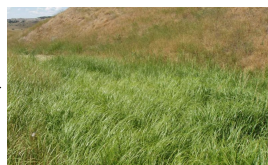
Prairie Cordgrass-Tall Warm-Season Grasses-Rhizomatous Wheatgrass

Prescribed grazing that breaks up litter mat followed by proper stocking, change in season of use, and adequate recover will move this PCP back to 1.1. Prescribed burning will also move this PCP back to 1.1.