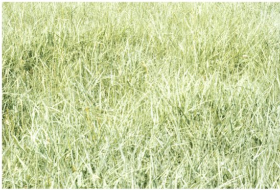
Figure 14. Plant Community Phase 1.3

This plant community occurs after an extended period of non-use, and where fire has been eliminated. The dominant plants tend to be similar to those found in the PCP 1.1, however in advanced stages, frequency and production can be lower. Litter amounts have increased causing plants to become decadent. Much of the plant nutrients are tied up in excessive litter. Organic matter oxidizes in the air rather than being incorporated into the soil due to the absence of animal impact. Typically, bunchgrasses develop dead centers and rhizomatous grasses (prairie cordgrass) form small colonies because of a lack of tiller stimulation. This plant community is not resistant to change. Grazing or fire can easily move it toward the Reference State. Soil erosion is not a concern due to increased litter levels and landscape position. This PCP does have the potential for invasion of Kentucky bluegrass and could, under the right conditions, transition to the Invaded State (2.0).