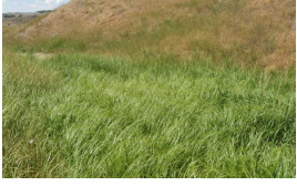
Prairie Cordgrass-Tall Warm-Season Grasses-Rhizomatous Wheatgrass