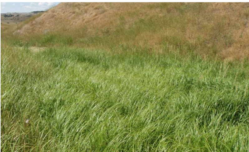
Figure 8. Plant Community Phase 1.1

The plant community phase (PCP) upon which interpretations are primarily based is the Prairie Cordgrass-Tall Warm-Season Grasses- Rhizomatous Wheatgrass Plant Community. This is also considered to be the Reference Plant Community (1.1). This plant community can be found on areas where grazed plants receive adequate periods of deferment during the growing season in order to recover. Historically, fires occurred infrequently. The potential vegetation is about 80 to 90 percent grasses and grass-like, 5 to 10 percent forbs, and 0 to 10 percent shrubs. Tall