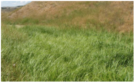
Prairie Cordgrass-Tall Warm-Season Grasses-Rhizomatous Wheatgrass