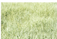
Decadent Plants/Excessive Litter