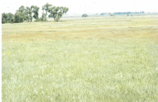
Figure 11. Plant Community Phase 1.2

This plant community developed under heavy, continuous seasonal grazing without periodic deferment. Prairie cordgrass, tall warm-season grasses, and Canada wildrye have been significantly reduced. Western wheatgrass will increase, while Kentucky bluegrass will begin to invade. Non-palatable forbs such as heath aster and ironweed have increased. Palatable forbs and shrubs are still present in small amounts. This plant community is at risk of losing tall warm-season grasses, palatable forbs, and shrubs. This community indicates key management concerns. Prescribed grazing at this point will stabilize the community at or near the Reference Plant Community phase (1.1), while increased disturbance can easily move the community to a more degraded state. While plant diversity has been reduced, the soil is stable. The water cycle, nutrient cycle, and energy flow is slightly reduced but continues to adequately function.