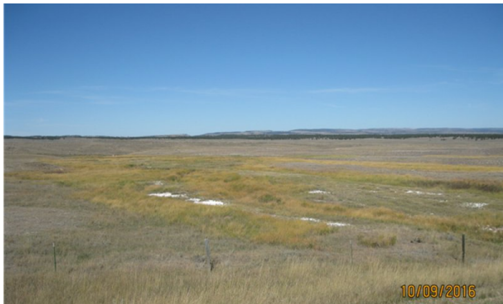
Figure 10. Saline Lowland - R060AY007SD - PCP 1.1.

The plant community upon which interpretations are primarily based is the Rhizomatous Wheatgrass-Prairie Cordgrass-Alkali Sacaton Plant Community (1.1). This is also considered the Reference Plant Community. Potential vegetation is about 65 to 90 percent grasses or grass-like plants, 5 to 10 percent forbs, 5 to 20 percent shrubs, and 0 to 5 percent trees. Saline-tolerant grasses dominate the plant community. Major grasses include rhizomatous wheatgrasses, alkali sacaton, Nuttall's alkaligrass, alkali and/or prairie cordgrass, and inland saltgrass. Woody plants are greasewood, fourwing saltbush, Gardner's saltbush, rubber rabbitbrush, and plains cottonwood. Shrubs such as greasewood and rubber rabbitbrush will occur in higher amounts in the western portions of the MLRA. This plant community is well adapted to the Northern Great Plains climatic conditions. Individual species can vary greatly in production depending on growing conditions (timing and amount of precipitation and temperature). Community dynamics, nutrient cycle, water cycle, and energy flow are functioning at the site's potential. Plant litter is properly distributed with some movement offsite, and natural plant mortality is low. The diversity in plant species allows for high drought tolerance.