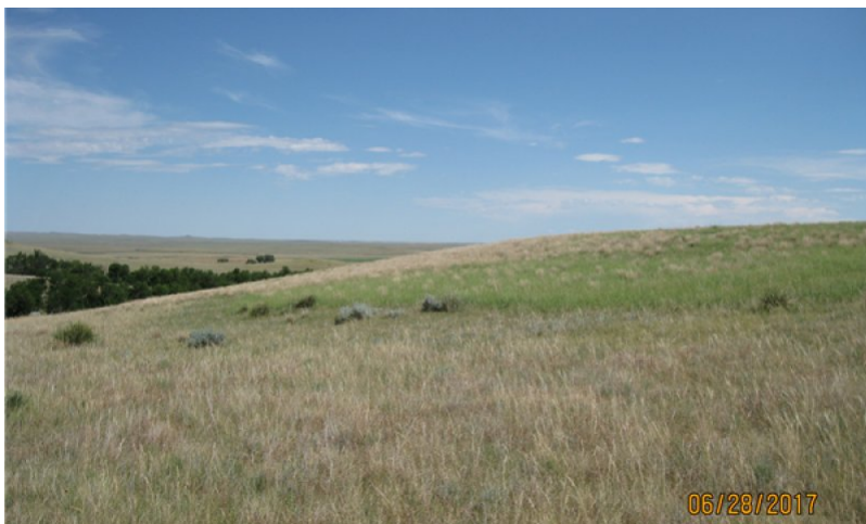
Figure 8. Sandy - R060AY009SD - PCP 1.1

The plant community upon which interpretations are primarily based is the Prairie Sandreed-Needle and Thread-Bluestem Plant Community (1.1). This is also considered the Reference Plant Community. This plant community can be found on areas that are properly managed with grazing and/or prescribed burning, and sometimes on areas receiving occasional short periods of deferment. The potential vegetation is about 85 to 95 percent grasses or grass-like plants, 5 to 10 percent forbs, and 0 to 5 percent shrubs. The site is dominated by mid- and tall- grasses. Major grasses are prairie sandreed, needle and thread, and little bluestem. Other grass and grass-like species occurring on the site include sand bluestem, blue grama, western wheatgrass, and threadleaf sedge. Significant forbs include dotted gayfeather, penstemon, and prairie coneflower. Shrubs in this community are rose, leadplant,