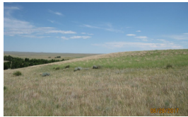
Prairie Sandreed-Needle and Thread-Bluestem

Prescribed grazing with adequate precipitation and time for recovery from grazing occurrences will move this plant community toward the Bluestem-Prairie Sandreed-Needle and Thread Plant Community (1.1). Prescribed burning can also be incorporated as a management tool.