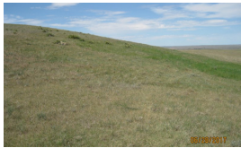
Prairie Sandreed-Needle and Thread-Blue Grama