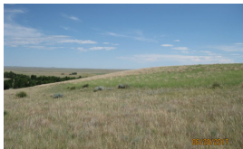
Prairie Sandreed-Needle and Thread-Bluestem