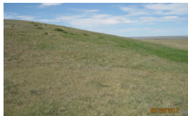
Prairie Sandreed-Needle and Thread-Blue Grama

Continuous season-long grazing or nonuse and no fire will convert the plant community to the Prairie Sandreed-Needle and Thread Plant Community (1.2).