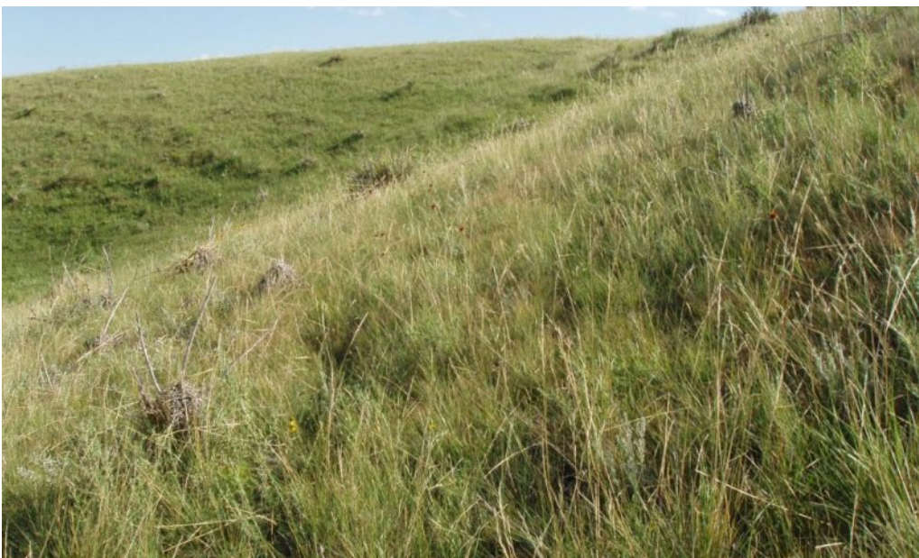
Figure 10. Plant Community Phase 1.1.