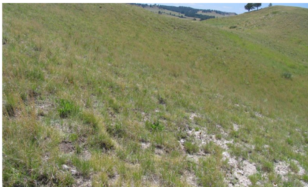
Figure 15. Plant Community Phase 1.3.

This plant community is a result from heavy grazing over many years. Diversity is diminished, as the short grasses become dominant in the plant community. The grazing-tolerant blue grama and sedges replace little bluestem and needlegrasses. Sideoats