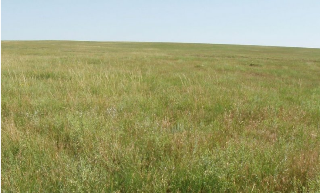
Figure 10. Plant Community Phase 1.1