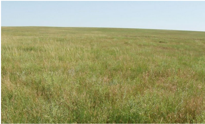
Figure 8. Plant Community Phase 1.1