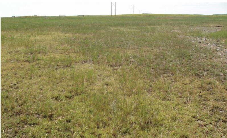
Figure 8. Plant Community Phase 1.1