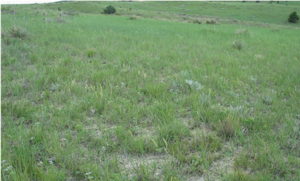
Figure 10. Shallow Clay - PCP 1.1.

Interpretations are primarily based on the Rhizomatous Wheatgrass-Sideoats Grama-Green Needlegrass Plant Community (1.1). This is also considered the Reference Plant Community. Potential vegetation is about 80 to 90 percent grasses or grass-like plants, 5 to 10 percent forbs, 5 to 10 percent shrubs, and 0 to 2 percent trees. Major grasses include western wheatgrass, green needlegrass, and sideoats grama. Other grasses and grass-likes occurring on this plant community include little bluestem, blue grama, prairie sandreed, big bluestem, bluebunch wheatgrass (in the western portion of the MLRA), and sedges. Forbs that commonly occur include purple coneflower, goldenpea, prairie coneflower, and scurfpea. Shrubs that are common in the MLRA include leadplant, rose, yucca, silver sagebrush, and Wyoming big sagebrush. Big sagebrush is more likely to occur in the western portions of the MLRA, and can make up from 5 to 10 percent of the annual production. Trees can include Rocky Mountain juniper and ponderosa pine. This plant community is well adapted to the Northern Great Plains climatic conditions.