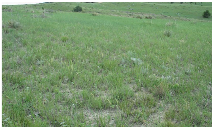
Figure 8. Shallow Clay - PCP 1.1.

Interpretations are primarily based on the Rhizomatous Wheatgrass-Sideoats Grama-Green Needlegrass Plant Community (1.1). This is also considered the Reference Plant Community. Potential vegetation is about 80 to 90 percent grasses or grass-like plants, 5 to 10 percent forbs, 5 to 10 percent shrubs, and 0 to 2 percent trees. Major grasses include western wheatgrass, green needlegrass, and sideoats grama. Other grasses and grass-likes occurring on this plant community include little bluestem, blue grama, prairie sandreed, big bluestem, bluebunch wheatgrass (in the western portion of the MLRA), and sedges. Forbs that commonly occur include purple coneflower, goldenpea, prairie coneflower, and scurfpea. Shrubs that are common in the MLRA include leadplant, rose, yucca, silver sagebrush, and Wyoming big sagebrush. Big sagebrush is more likely to occur in the western