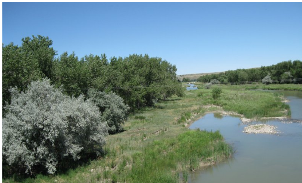
Figure 19. Loamy Overflow - R060Y020SD - PCP 5.1

This plant community developed due to the lack of woody regeneration, natural occurrences of flooding events, and continuous season-long grazing without adequate recovery periods. Older mature trees remain, including cottonwood, boxelder, and green ash. The trees are scattered, and the site may have a “park-like” appearance with few trees and reduced understory. If grazed during the winter, the increased durations of livestock loitering can result in manure accumulations and soil compaction which will reduce the vigor of the native understory plant community. Kentucky bluegrass and smooth brome continue to persist as dominant grass species at reduced production rates. The presence of non-desirable forb species such as Canada thistle, burdock, and hound's tongue can be prolific and difficult to control. Russian olive and/or saltcedar will increase over time and will eventually dominate the site.