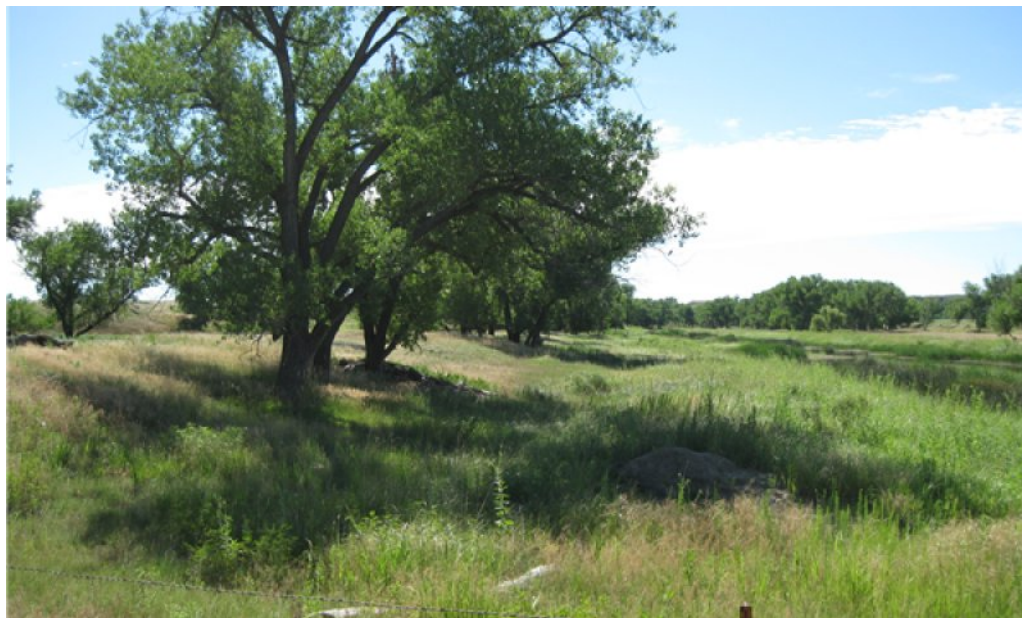
Figure 10. Loamy Overflow - R060AY020SD - PCP 1.1