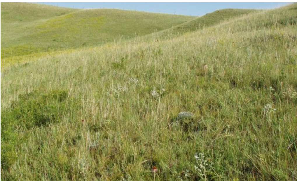
Figure 10. Plant Community Phase 1.1

The plant community upon which interpretations are primarily based is the Bluestem-Sideoats Grama-Needlegrass-Wheatgrass Plant Community (1.1). This is also considered