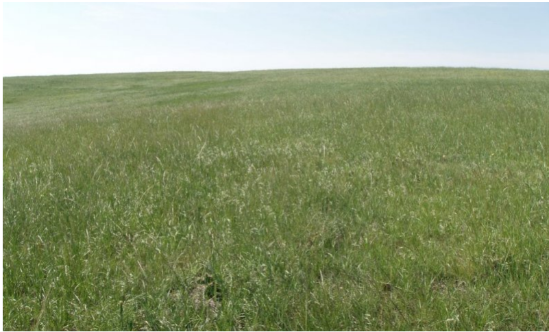
Figure 8. Clayey 16-18" PZ - PCP 1.1

The plant community upon which interpretations are primarily based is the Western Wheatgrass-Green Needlegrass Plant Community (1.1). This is also considered the Reference Plant Community. The potential vegetation is about 85 to 95 percent grasses or grass-like plants, 5 to 10 percent forbs, and 2 to 5 percent shrubs. Cool-season grasses dominate this plant community. Major grasses include western wheatgrass and green needlegrass. Other grasses occurring on the site include sideoats grama, blue grama, buffalograss, prairie Junegrass, and sedge. Significant forbs include scarlet globemallow, wild parsley, biscuitroot, deer vetch, American vetch, and milkvetch. The significant shrubs that occur include cactus and rose. This plant community is well adapted to the Northern Great Plains climatic conditions. Individual species can vary greatly in production depending on growing conditions (timing and amount of precipitation and temperature). The diversity in plant species allows for high drought tolerance. Moderate or high available water capacity provides a favorable soil-water-plant relationship. Overall the interpretive plant community has the appearance of being extremely stable, diverse, and productive. Litter normally falls in place, and does not occur in excess amounts. Most plant species have a wide range of age classes represented and reproduction is not limited. Plant roots occupy most of the soil profile, which provides for soil stability and promotes infiltration.