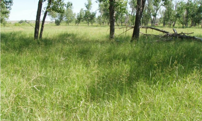
Figure 8. Lowland - PCP 1.1.

The plant community upon which interpretations are primarily based is the Rhizomatous Wheatgrasses-Green Needlegrass/Cottonwood Plant Community. This is also considered the Reference Plant Community. Potential