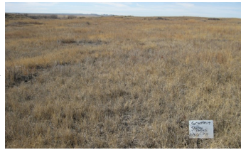
Rhizomatous Wheatgrass-Little Bluestem/Sagewort/Shrubs

Continuous season-long grazing and extended periods of drought will convert the Reference Plant Community (1.1) to the Rhizomatous Wheatgrass-Little Bluestem/Sagewort/Shrubs Plant Community (1.2).