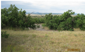
Bur Oak-Ponderosa Pine/Shrubs/Bare Ground