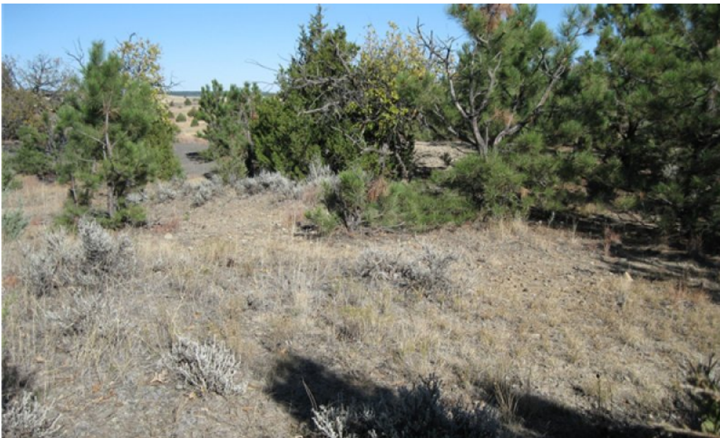
Figure 20. Shallow Porous Clay - PCP 2.2

This Plant Community (PC) is most common in the southern portion of the MLRA where bur oak is uncommon or does not occur, or when pine and/or juniper become the dominant trees in PC 2.1. This plant community is the result of encroachment of ponderosa pine and/or juniper from adjacent plant communities. Ponderosa pine and juniper dominate this Plant Community Phase (PCP). Vegetation consists of about 50 to 75 percent grasses and grass-like plants, 5 to 20 percent forbs, and 5 to 30 percent woody plants. The dominant grasses and grass-likes include little bluestem and sedges. Significant forbs include prairie coneflower, purple prairie clover, and goldenpea. Leadplant, rose, and Wyoming big sage has decreased, but is still present. Considerable bare ground may be present under the tree canopy. Where severe erosion has created clay dunes or gullies,