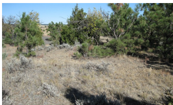
Ponderosa Pine-Rocky Mountain Juniper/Bare Ground