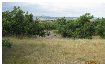
Bur Oak-Ponderosa Pine/Shrubs/Bare Ground