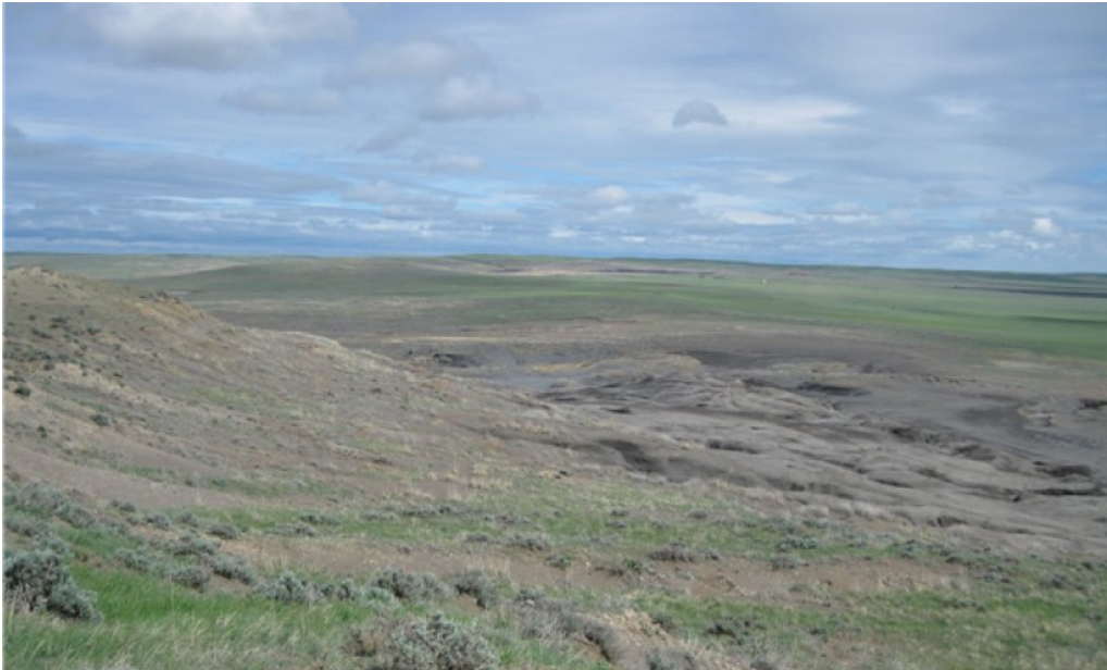
Figure 23. Shallow Porous Clay - PCP 3.1

This Plant Community consists of sparse herbaceous or woody vegetation. Species with deep root systems can persist on this site in areas that are not directly affected by erosion or have stabilized.