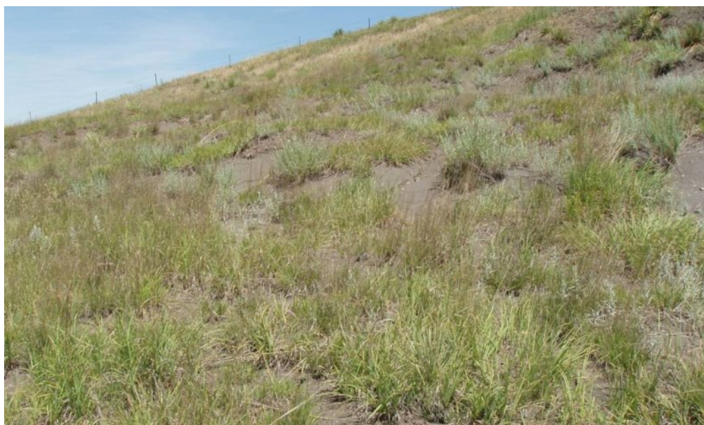
Figure 11. Shallow Porous Clay - PCP 1.1