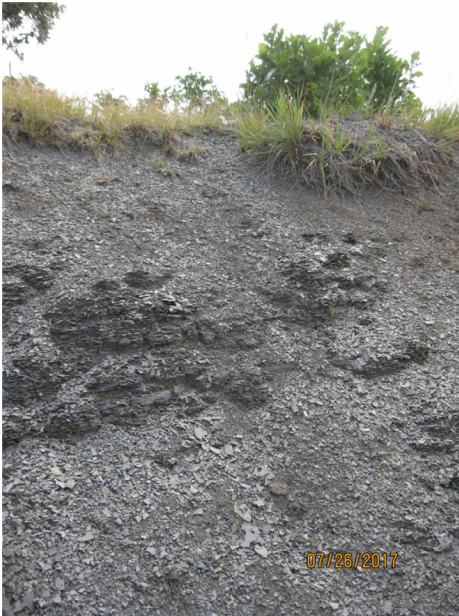
Figure 8. Grummit - Shallow Porous Clay - R060AY043SD