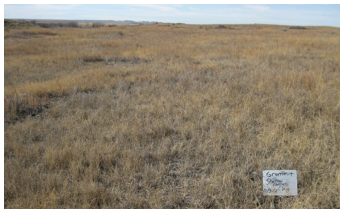
Rhizomatous Wheatgrass-Little Bluestem/Sagewort/Shrubs