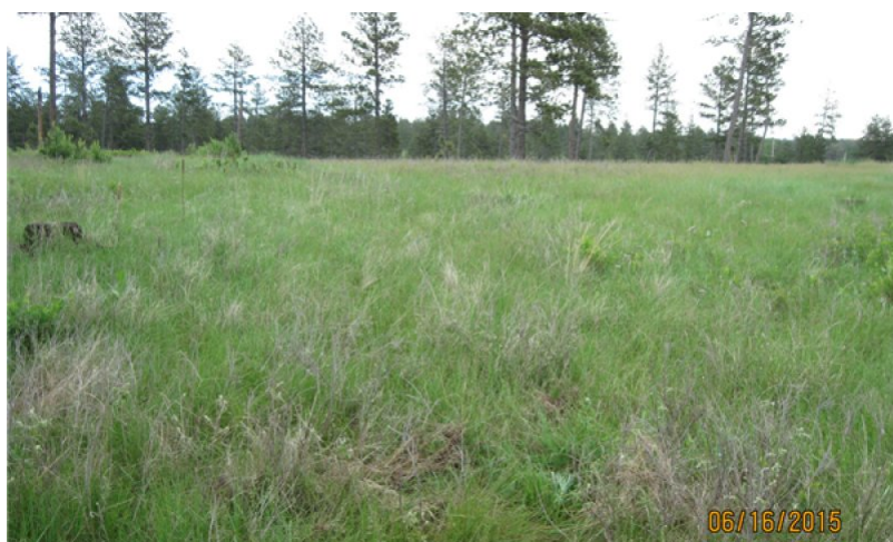
Figure 8. Loamy North 062XA010SD PCP-1.1

Interpretations are based primarily on the Rhizomatous wheatgrass-Needlegrass-Bluestem/Forb/Shrub plant community phase. This is also considered to be the reference or historic plant community. The potential vegetation is about 75 percent grass and grass-like plants, 15 percent forbs, 10 percent shrubs and 0 to 2 percent trees. Total