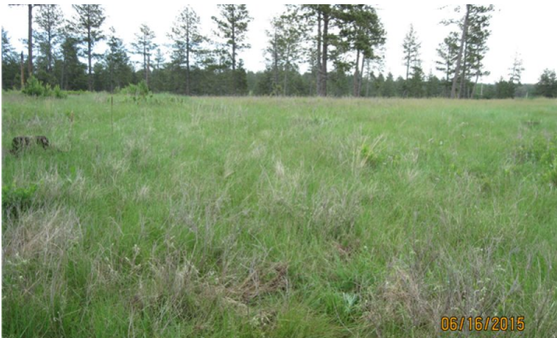
Figure 8. Loamy North 062XA010SD PCP-1.1

Interpretations are based primarily on the Rhizomatous wheatgrass-Needlegrass-Bluestem/Forb/Shrub plant community phase. This is also considered to be the reference or historic plant community. The potential vegetation is about 75 percent grass and grass-like plants, 15 percent forbs, 10 percent shrubs and 0 to 2 percent trees. Total