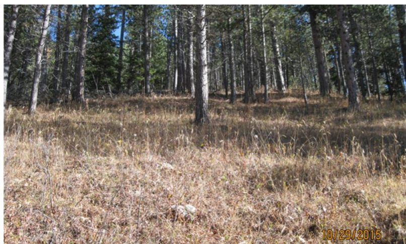
Figure 10. Thin Upland - PCP 4.2, Ponderosa Pine