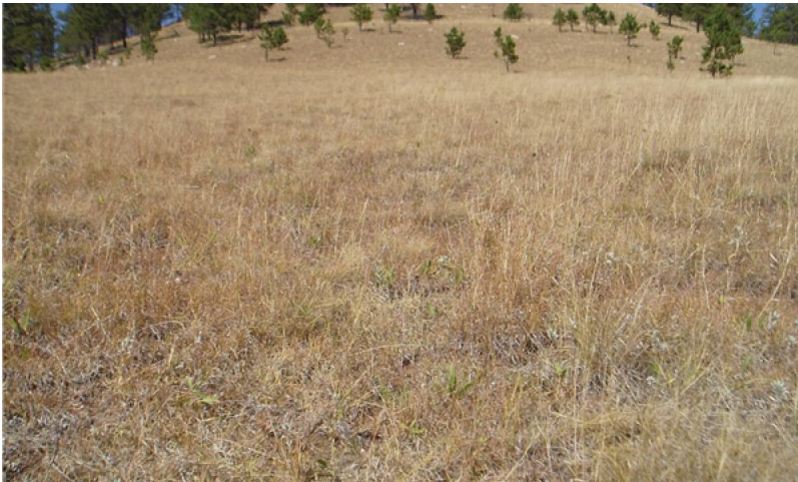
Figure 9. Thin Upland PCP 1.1

Interpretations are based primarily on the Little bluestem-Sideoats grama-Wheatgrass/Forb/Conifer plant community phase. This site also is considered to be the Reference or historic plant community. The potential vegetation consists of about 80 percent grass and grass-like plants, 15 percent forbs, 5 percent shrubs and 0 to 2 percent trees. Total annual production for a normal growing year is approximately 2,000 lbs. /Ac. The community is dominated by warm-season grasses including little bluestem, sideoats grama, blue and hairy grama and plains muhly. Cool-season grasses and grass-like plants include western and bearded wheatgrass, porcupine grass, prairie junegrass, and threadleaf sedge. Forbs are common and diverse, but prairie coneflower almost always is present. Shrubs include prairie rose and fringed sagewort. Conifers may be present, but in small amounts. This plant community is productive and resilient to disturbances such as drought and fire. It is a sustainable plant community in regards to soil/site stability, watershed function, and biological integrity.