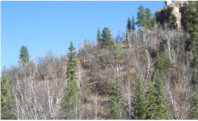
Figure 11. Thin Upland PCP 4.1, Pine and Deciduous Trees

This plant community developed due to pine encroachment, no use and or no fire. The potential plant community is made up of 55 percent grasses and grass-like species, 10 percent forbs, 10 percent shrubs, and 25 percent trees. Total annual production can be very variable depending upon species composition. The dominant grass and grass-like species are poverty oats, bluegrass, rough-leaf ricegrass, Canada wildrye, slender wheatgrass, and sedge. The dominant forbs include Oregon grape, pinedrops, pussy toes, and western yarrow. The dominant shrubs include western snowberry, hop hornbeam, common juniper, and creeping juniper. Trees can include ponderosa pine, Rocky Mountain juniper, paper birch, and bur oak. The sites in the northern LRU are more likely to have the mixed conifer and deciduous tree species. The south LRU is more likely to have ponderosa pine and juniper in this plant community.