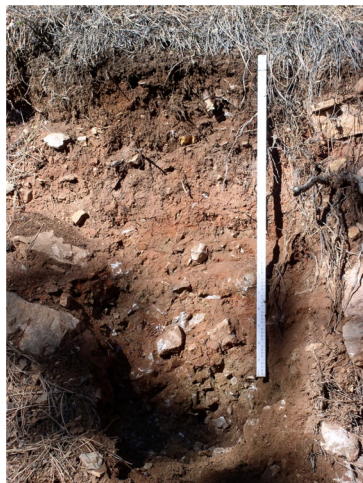
Figure 6. Thin Upland Soil Profile

Access Web Soil Survey ( http://websoilsurvey.nrcs.usda.gov/app/ ) for specific local soils information.