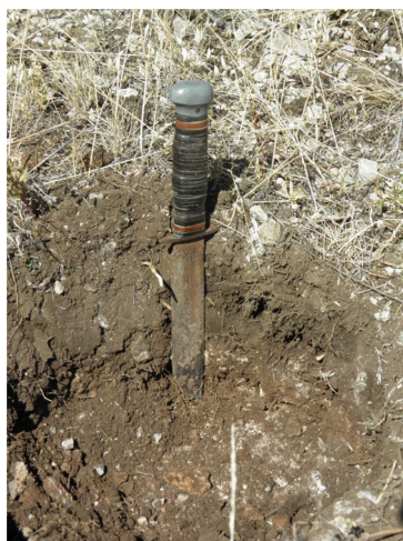
Figure 6. Very Shallow Soil Profile

Access Web Soil Survey ( http://websoilsurvey.nrcs.usda.gov/app/ ) for specific local soils information.