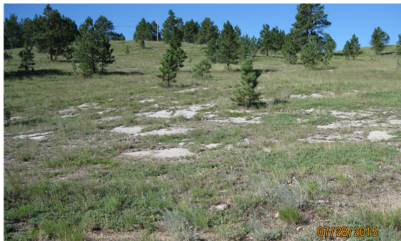
Figure 9. Very Shallow PCP-1.2

This plant community is a result of continuous season-long grazing or heavy, continuous grazing with no change in season of use between grazing years. Drought or extended periods of below normal precipitation also can be a driver. The potential plant community is made up of approximately 65 percent grasses and grass-like species, 15 percent forbs, and 20 percent shrubs and trees. Dominant grasses include blue grama, hairy grama, threadleaf sedge, and plains muhly. Little bluestem, sideoats grama, needleandthread, and some wheatgrass will be present, but in small amounts. Some introduced cool-season species such as Kentucky bluegrass and smooth brome may also be present. Forbs contribute substantially to the biomass production in this plant community, as do the low-growing shrubs. Ponderosa pine can be scattered throughout the site, but will not exceed 5 percent canopy cover. The herbaceous species within this plant community are well-adapted to grazing.