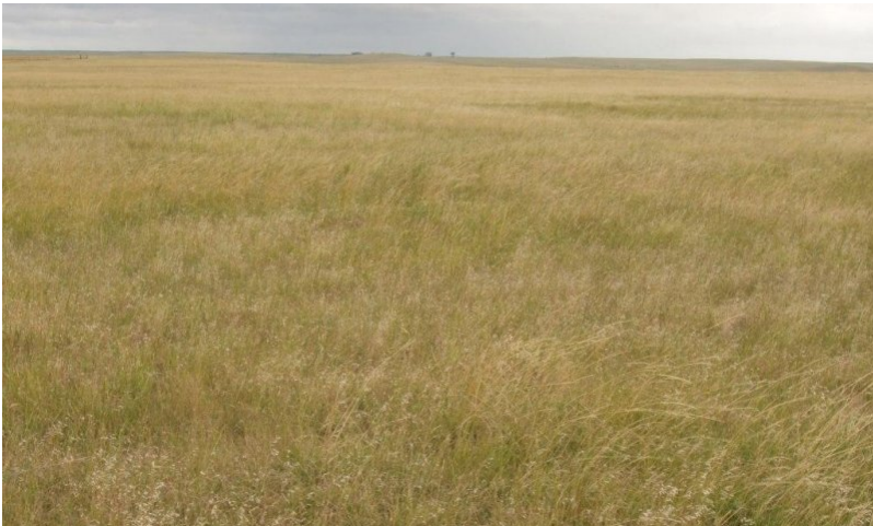
Figure 8. Claypan - R063BY013SD - PCP 1.1.

Interpretations are based primarily on the Western Wheatgrass-Green Needlegrass-Blue Grama Plant Community Phase (this is also considered to be Reference Plant Community 1.1). The potential vegetation was about 75 percent grasses or grass-like plants, 10 percent forbs, and 15 percent shrubs. The community was dominated by cool-season grasses with warm-season grasses being subdominant. The major grasses included western wheatgrass, green needlegrass, blue grama, needle and thread, and sideoats grama. Other grass or grass-like species included slender wheatgrass, porcupine grass, buffalograss, and sedges. This plant community was resilient and well adapted to the Northern Great Plains climatic conditions. The diversity in plant species allowed for high drought tolerance. This was a sustainable plant community in regards to site/soil stability, watershed function, and biologic integrity.