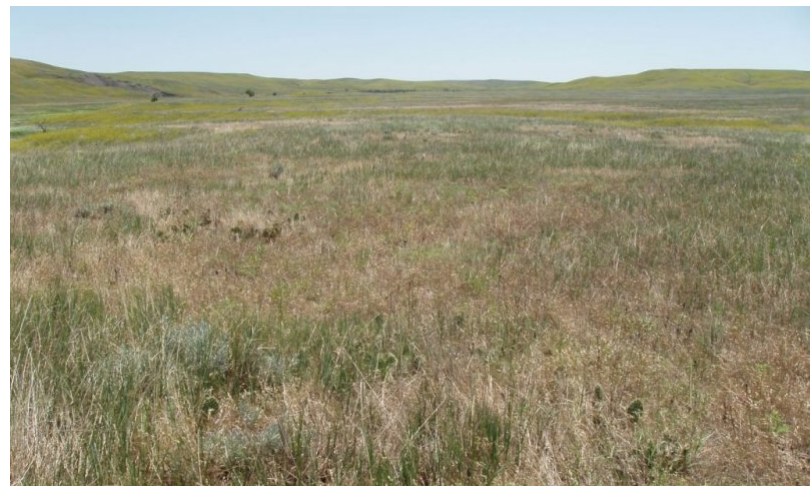
Figure 8. Thin Claypan - R063BY015SD - PCP 1.1.