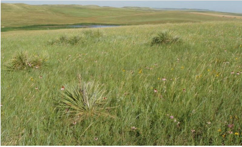
Figure 8. Shallow Clay - PCP 1.1.