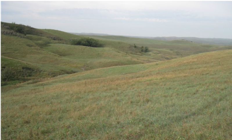
Figure 9. Shallow Clay - PCP 1.1.

Interpretations are based primarily on the Needlegrass-Bluestem-Western Wheatgrass Plant Community (this is also considered to be Reference Plant Community). The potential vegetation is about 80 percent grasses or grass-like plants, 10 percent forbs, 8 percent shrubs, and 2 percent trees. The community is dominated by both cool- and warm-season grasses. The major grasses include western wheatgrass, big bluestem, green needlegrass, sideoats grama, and little bluestem. Other grass and grass-like species include needle and thread, porcupinegrass, blue grama, buffalograss, and sedges. This plant community is resilient and well adapted to the Northern Great Plains climatic conditions. The diversity in plant species allows for high tolerance for drought. This is a sustainable plant community in regard to site/soil stability, watershed function, and biologic integrity.