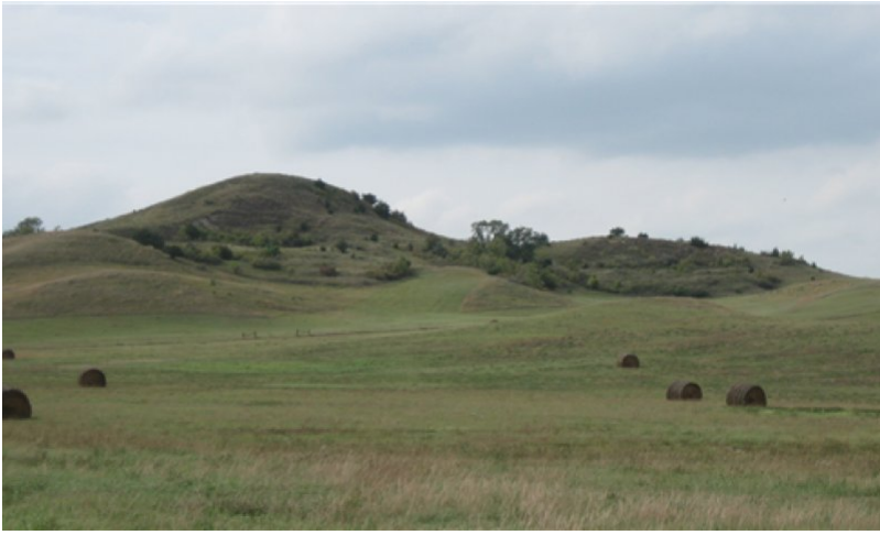
Figure 16. Shallow Clay - PCP 3.1.