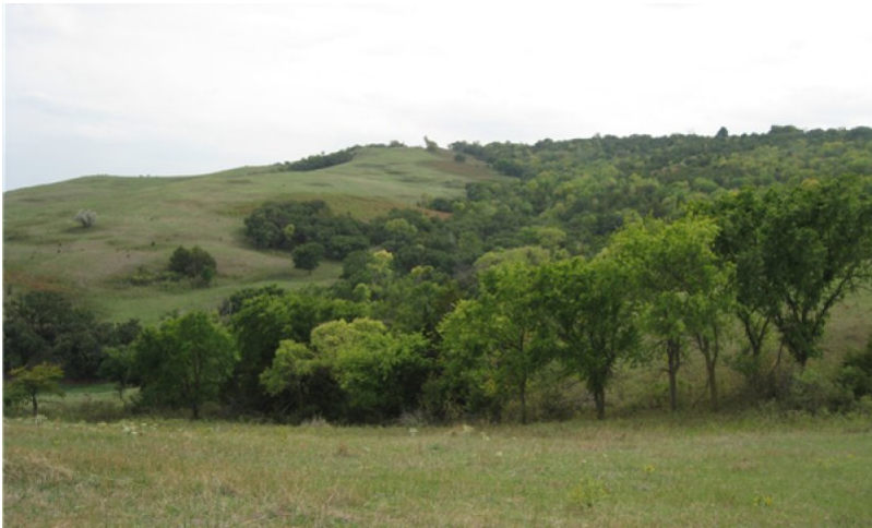
Figure 17. Shallow Clay - PCP 3.1.

This plant community can develop in swales and areas where slopes have slumped due to increased hydrology beyond the point where the slope remains stable. These areas typically occur in north- or east-facing slopes that tend to be cooler and wetter. The tree canopy can exceed 20 percent when mature. The potential plant community is made up of approximately 50 percent grasses and grass-like species, 10 percent forbs, 10 percent shrubs, and 30 percent trees. Dominant grasses and grass-likes include western wheatgrass, green needlegrass, Canada wildrye, sideoats grama, little bluestem, and sedges. As the canopy increases, warm-season grasses tend to decrease as the cool- season grasses increase. Forbs will be diverse. Shrubs will include western snowberry, sumac, currant, and rose. Trees species can include, green ash, bur oak, American elm, hackberry and juniper. Compared to the Needlegrass-Bluestem-Western Wheatgrass Plant Community (1.1), deciduous trees have increased significantly and herbaceous component has decreased. This plant community is susceptible to the encroachment of eastern redcedar and Rocky Mountain juniper.