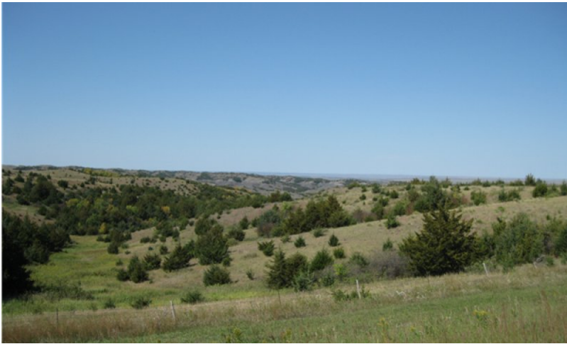
Figure 19. Shallow Clay - PCP 3.2.