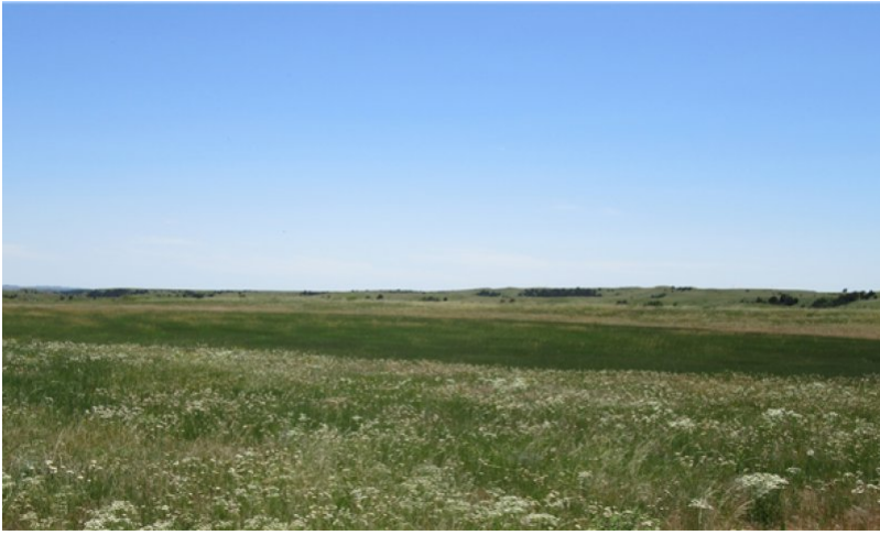
Figure 8. Closed Depression - PCP 1.1 Wet Phase.