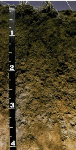
Figure 8. Duroc loam (depth in feet), Cheyenne County, NE

Note: Revisions to soil surveys are on-going. For the most recent updates, visit the Web Soil Survey, the official site for soils information: http://websoilsurvey.nrcs.usda.gov/app/WebSoilSurvey.aspx .