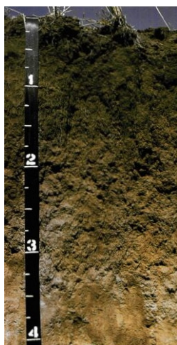
Figure 8. Duroc loam (depth in feet), Cheyenne County, NE

Note: Revisions to soil surveys are on-going. For the most recent updates, visit the Web Soil Survey, the official site for soils information: http://websoilsurvey.nrcs.usda.gov/app/WebSoilSurvey.aspx .