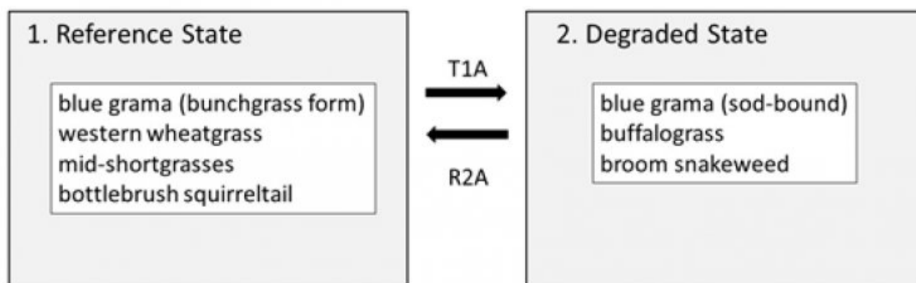
Figure 4. Generalized STM for upland sites in 70A