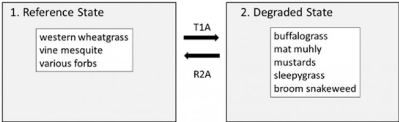
Figure 4. Generalized STM for run-on sites in 70A