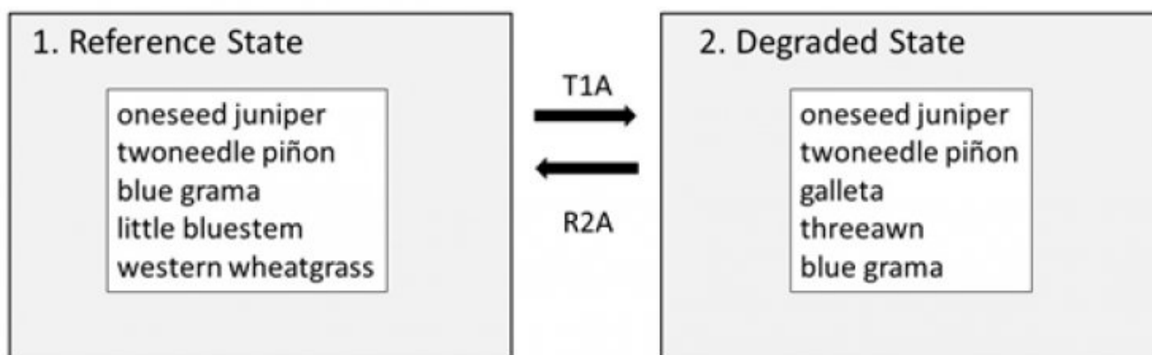
Figure 4. Generalized STM for shallow sites in 70A. Refer to the interactive STM for more site-specific information.