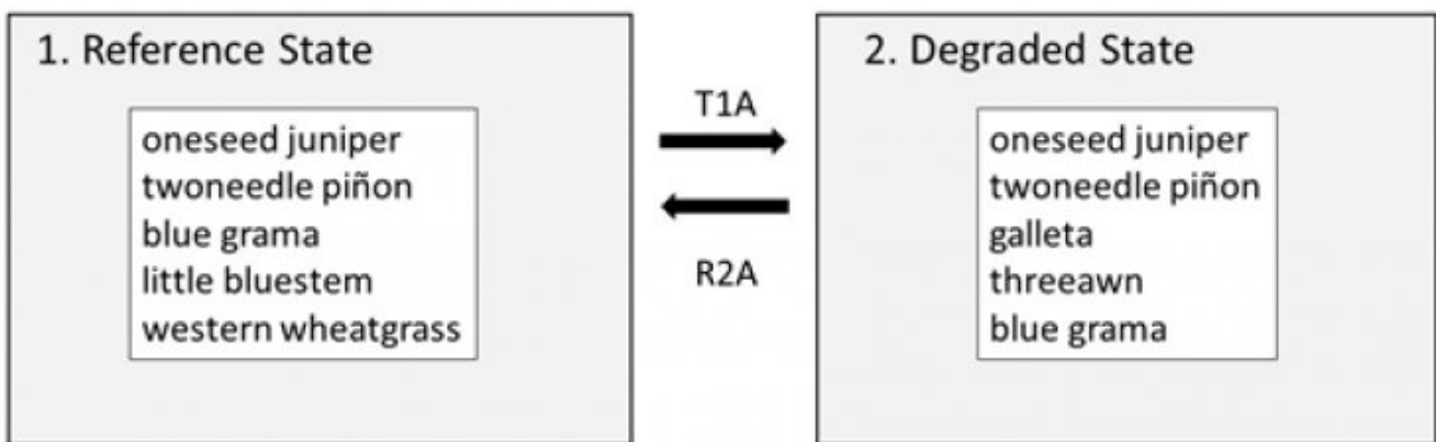
Figure 4. Generalized STM for shallow sites in 70A. For more site-specific information, see the interactive STM.