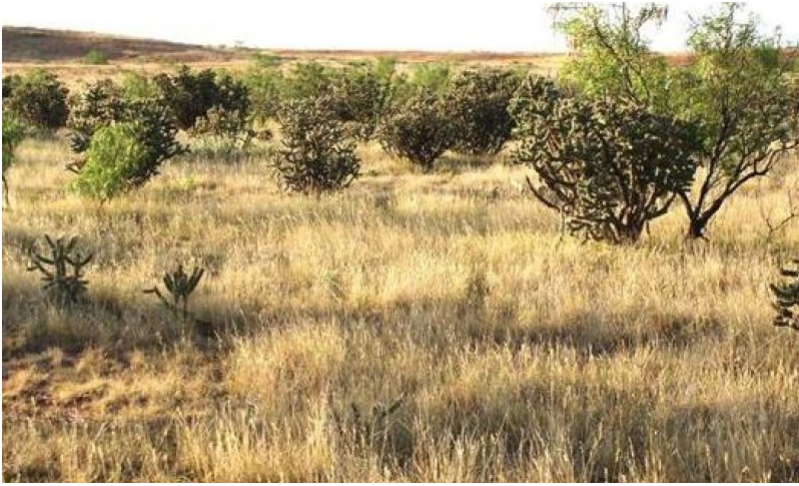
Figure 7. 2.1 Shortgrass/Shrub Community

The Shortgrass/Shrub Community (2.1) shows some departure from the HCPC but still retains site integrity. Total grass and forb production is still close to that of the HCPC while shrub production is higher. The site is still stable. Ground cover is adequate for soil protection, and plant community functions are not greatly out of balance. However, brush invasion has reached a level of concern if the site is to remain a grassland rather than a shrubland. Brush management, prescribed fire, and prescribed grazing could move this community more toward the HCPC. However, galleta, once established, does not generally yield to an increase in blue grama easily.