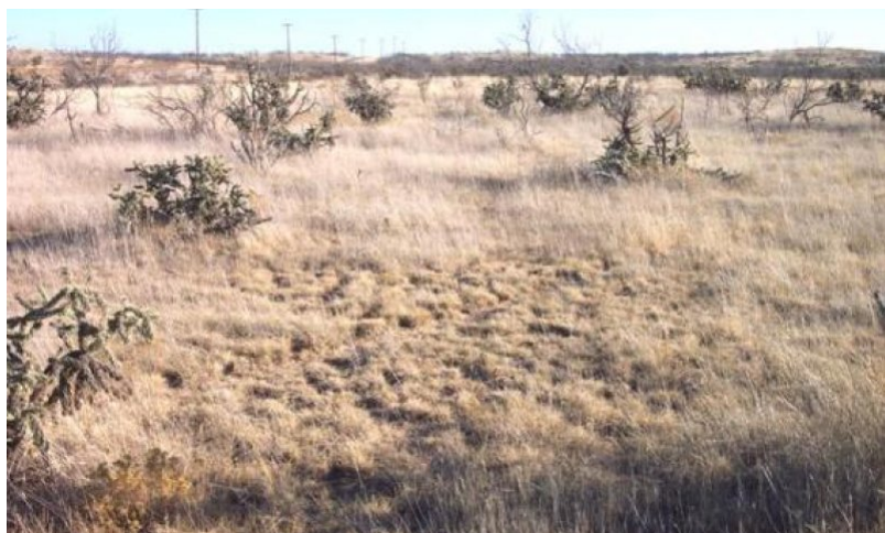
Figure 4. 1.1 Shortgrass Community

The Shortgrass Community (1.1) is the interpretive plant community for the Clay Loam ecological site. The plant community is composed of approximately 45 to 60 percent blue grama and 15 to 25 percent galleta, with sideoats grama making up from 5 to 10 percent of total production. Other shortgrass species, forbs and shrubs make up the remainder of the production. Shrubs make up 5 to 8 percent of the total community production. Overall production is moderate compared to other ecological sites in the MLRA. Production for the HCPC ranges from 750 to 1450 pounds of air dry weight per acre. The amount of woody shrubs and cacti shown in this photo is slightly high for the HCPC, but could be considered in the acceptable range. Cholla is the main cactus species and mesquite is present in scattered amounts. Good grazing management will perpetuate a healthy shortgrass community, but, without occasional prescribed fire, or some individual plant treatment on the cholla and the mesquite, this community will slowly shift toward more shrub cover.