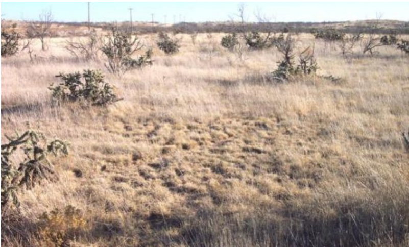
Figure 4. 1.1 Shortgrass Community

The Shortgrass Community (1.1) is the interpretive plant community for the Clay Loam ecological site. The plant community is composed of approximately 45 to 60 percent blue grama and 15 to 25 percent galleta, with sideoats grama making up from 5 to 10 percent of total production. Other shortgrass species, forbs and shrubs make up the remainder of the production. Shrubs make up 5 to 8 percent of the total community production. Overall production is moderate compared to other ecological sites in the MLRA. Production for the HCPC ranges from 750 to 1450 pounds of air dry weight per acre. The amount of woody shrubs and cacti shown in this photo is slightly high for the HCPC, but could be considered in the acceptable range. Cholla is the main cactus species and mesquite is present in scattered amounts. Good grazing management will perpetuate a healthy shortgrass community, but, without occasional prescribed fire, or some individual plant treatment on the cholla and the mesquite, this community will slowly shift toward more shrub cover.