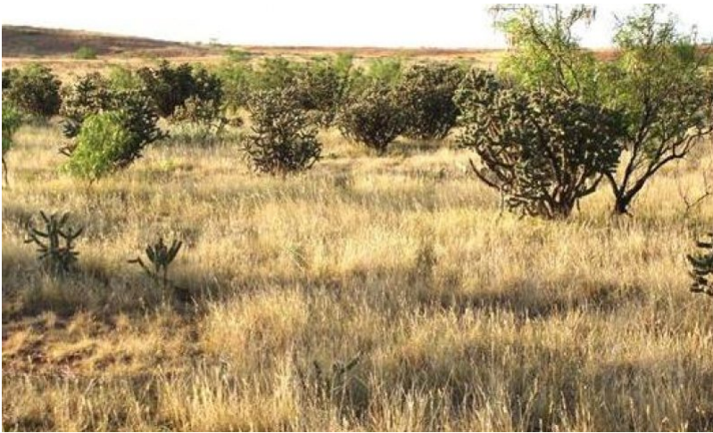
Figure 7. 2.1 Shortgrass/Shrub Community

The Shortgrass/Shrub Community (2.1) shows some departure from the HCPC but still retains site integrity. Total grass and forb production is still close to that of the HCPC while shrub production is higher. The site is still stable. Ground cover is adequate for soil protection, and plant community functions are not greatly out of balance. However, brush invasion has reached a level of concern if the site is to remain a grassland rather than a shrubland. Brush management, prescribed fire, and prescribed grazing could move this community more toward the HCPC. However, galleta, once established, does not generally yield to an increase in blue grama easily.