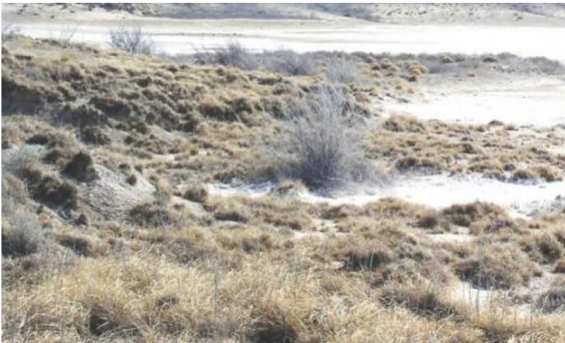
Figure 8. 1.1 Midgrass/Shortgrass Community

The reference plant community is a combination of mid and shortgrasses with a few salt tolerant forbs and shrubs. Tall grasses occur in isolated places where the environment is more hospitable. Grasses make up approximately 80 percent of the total vegetation while forbs and shrubs make up approximately 20 percent. The dominant grass species is alkali sacaton with lesser amounts of inland saltgrass, creeping muhly, whorled dropseed, scratchgrass muhly, and meadow dropseed. The principal forbs are salt tolerant annuals. Principal shrubs include four-wing saltbush and willow baccharis. Forty to fifty percent bare ground was present where saline conditions were high. Most energy and nutrient cycling was contained in the narrow grass/soil interface where evapo-transpiration was minimal.