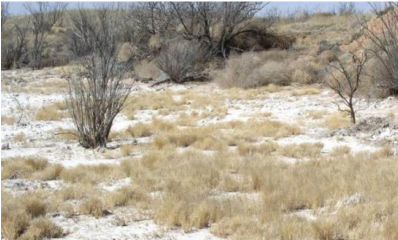
Figure 11. 2.1 Shrub/Shortgrass/Annuals Community

This plant community represents the first phase in the transition of the Midgrass/Shortgrass Community (1.1) towards the Shrub Dominant Community (3.1). Alkali sacaton will decrease as inland saltgrass, muhlenbergia and dropseed species increase. There will be a dramatic increase in willow baccharis and an invasion of salt cedar. The woody shrub component may represent 40 to 50 percent or more of the total vegetation. In areas with declining water tables, herbaceous production will decrease with increases in soil salinity. Once the invasion of salt cedar starts a threshold has been crossed. Returning to reference condition will require brush management along with prescribed grazing. Prescribed burning may be difficult with the reduced vegetative fuel and poor continuity.