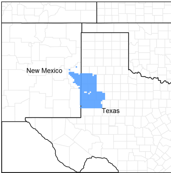
Figure 1. Mapped extent

Provisional. A provisional ecological site description has undergone quality control and quality assurance review. It contains a working state and transition model and enough information to identify the ecological site.