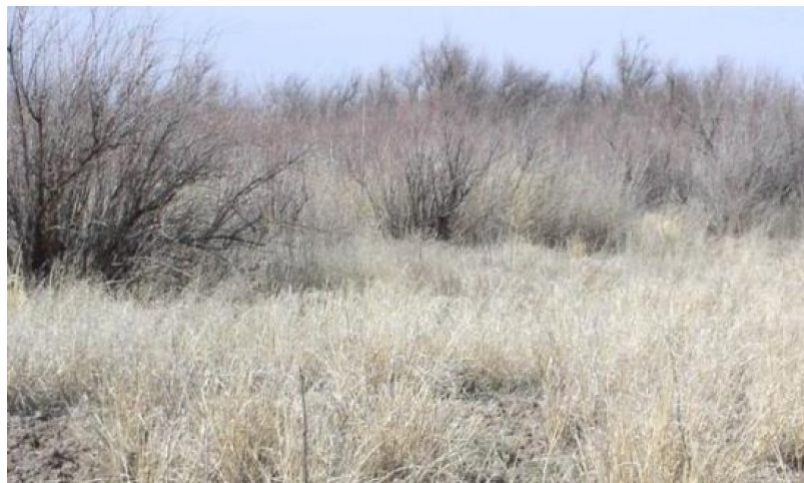
Figure 14. 3.1 Shrub Dominant Community

Salt cedar increases on the site to the point of domination (>75% canopy) with very few understory plants present. The percent bare ground may be even less than the reference community with salt cedar plants filling the voids. Scattered low quality grasses and annuals occur in areas where the salt cedar canopy opens up. Soil salinity continues to increase. This phase of retrogression has low forage production potential and the ecological processes are not functioning very well. Poor hydrological conditions prevail. Major energy inputs are necessary to restore the site to near reference conditions. These include brush management, soil amendments, range seeding, and prescribed grazing. Other factors such as the changing water table may prevent the site from improving regardless of management.