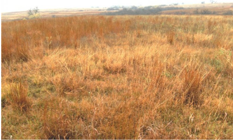
Figure 8. Cordell soils Washita County OK

This is the interpretative plant community description for this site. It is a mixed-grass prairie, dominated by a mixture of little bluestem, sideoats grama, blue grama, hairy grama, dropseed, buffalograss. Palatable perennial forbs are well represented over the site. These forbs include western ragweed, halfshrub sundrop, daisy fleabane, dotted gayfeather, Nutall’s sensitive-brier, Illinois bundleflower, compassplant, prairie coneflower, leadplant, and others. Shrub species including skunkbush sumac, fragrant mimosa, and prickly pear are usually present in small amounts. The amount of woody species on site can be minimized by occasional fire (prescribed burning). This plant community is very durable. With proper grazing management and prescribed burning, the proportions of major grasses and forbs in this community can be maintained indefinitely. Although this site is usually described as a “Mixed Grass Prairie”, it is very obvious that tallgrasses can dominate some inclusional areas of deeper soils. There are also areas that are almost barren.