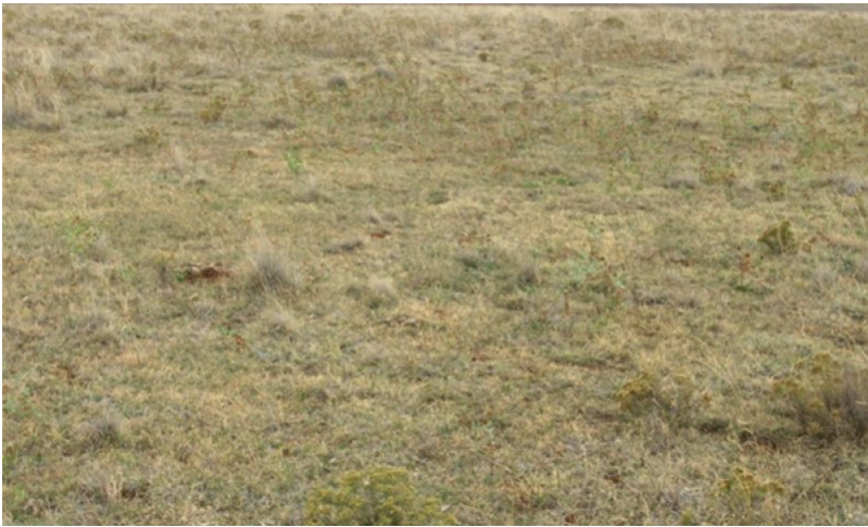
Figure 11. Cordell soils Washita County, OK

Red Shale sites have a long history of severe overgrazing by cattle and this plant community phase is common. Shortgrasses make up most of the forage production and include blue grama, buffalograss, hairy grama, Carolina crabgrass, Scribner’s panicum, windmillgrass and tumblegrass. Most of the palatable forbs have been eliminated. Forbs that have increased include white heath aster, Missouri goldenrod, western ragweed, slimflower scurfpea, and blue wild indigo. The tallgrasses, especially big bluestem and Indiangrass, are present throughout the site on the areas of deeper soils, but are preferred by livestock and therefore remain in a state of relatively low vigor as grazing occurs. Grazing drives the site towards this community, and essentially keeps the site in this state. Annuals common to the site are western ragweed, common broomweed, prairie threeawn and broom snakeweed. Shrubs, including buckbrush and fragrant mimosa usually increase in abundance where prescribed burning is not practiced. Prescribed grazing, involving deferment during all or a part of the growing season will revive the vigor and stature of the taller grasses. This practice used in conjunction with prescribed burning can restore the vegetation to near reference proportions in two to five years.