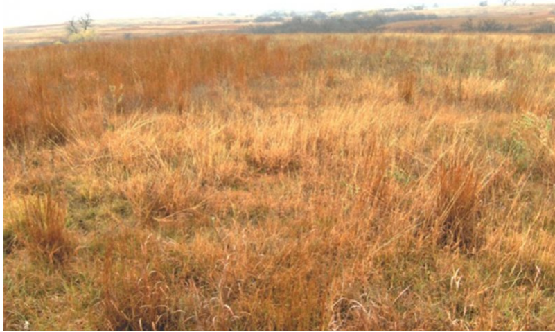
Figure 8. Cordell soils Washita County OK

This is the interpretative plant community description for this site. It is a mixed-grass prairie, dominated by a mixture of little bluestem, sideoats grama, blue grama, hairy grama, dropseed, buffalograss. Palatable perennial forbs are well represented over the site. These forbs include western ragweed, halfshrub sundrop, daisy fleabane, dotted gayfeather, Nutall’s sensitive-brier, Illinois bundleflower, compassplant, prairie coneflower, leadplant, and others. Shrub species including skunkbush sumac, fragrant mimosa, and prickly pear are usually present in small amounts. The amount of woody species on site can be minimized by occasional fire (prescribed burning). This plant community is very durable. With proper grazing management and prescribed burning, the proportions of major grasses and forbs in this community can be maintained indefinitely. Although this site is usually described as a “Mixed Grass Prairie”, it is very obvious that tallgrasses can dominate some inclusional areas of deeper soils. There are also areas that are almost barren.