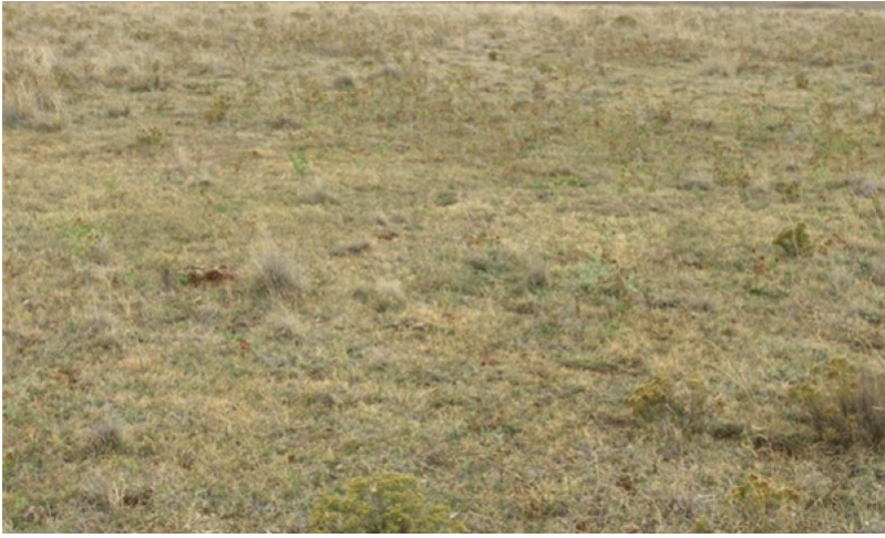
Figure 11. Cordell soils Washita County, OK

Red Shale sites have a long history of severe overgrazing by cattle and this plant community phase is common. Shortgrasses make up most of the forage production and include blue grama, buffalograss, hairy grama, Carolina crabgrass, Scribner's panicum, windmillgrass and tumblegrass. Most of the palatable forbs have been eliminated. Forbs that have increased include white heath aster, Missouri goldenrod, western ragweed, slimflower scurfpea, and blue wild indigo. The tallgrasses, especially big bluestem and Indiangrass, are present throughout the site on the areas of deeper soils, but are preferred by livestock and therefore remain in a state of relatively low vigor as grazing occurs. Grazing drives the site towards this community, and essentially keeps the site in this state. Annuals common to the site are western ragweed, common broomweed, prairie threeawn and broom snakeweed. Shrubs, including buckbrush and fragrant mimosa usually increase in abundance where prescribed burning is not practiced. Prescribed grazing, involving deferment during all or a part of the growing season will revive the vigor and stature of the taller grasses. This practice used in conjunction with prescribed burning can restore the vegetation to near reference proportions in two to five years.