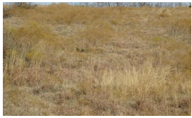
Short/Midgrass Prairie Community