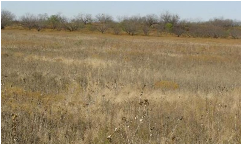
Figure 22. 4.2 Abandoned Land Community

The soils of this site are poorly suited to cultivation or conversion to pastureland. Therefore, most of the acres of this site that were cultivated in the past have been abandoned because of very low yields and poor economics. Abandoned croplands and reseeded areas tend to revert back to a more natural state through the process of secondary succession. This is a very slow process that takes decades or centuries dependent on the status of the area at the time it is abandoned. The first plants to establish are annual forbs and grasses followed by early successional shortgrasses and midgrasses. If managed properly, some of these abandoned areas may eventually begin to approximate the diversity and complexity of the historic Shallow Clay ecosystem. Midgrasses and perennial forbs may begin to establish if the area is carefully managed. However, it is highly unlikely that abandoned lands can ever return to climax vegetation within a reasonable period of time.