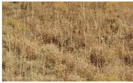
Mid/Shortgrass Prairie Community

Applying conservation practices such as Prescribed Grazing and Prescribed Burning can restore the Short/Midgrass Prairie Community back to the Mid/Shortgrass Prairie Community.