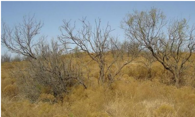
Figure 14. 2.1 Shortgrass/Forb/Shrub Community

This plant community is the result of prolonged periods of damaging disturbances and neglect which may include continuous abusive grazing and total lack of prescribed fire or brush management. Perennial shortgrasses, including buffalograss, curlymesquite, and threeawns dominate the site along with annual forbs and grasses. Invading shrubs such as mesquite, lotebush, and pricklypear increase in density and canopy, but their growth habit is stunted because of shallow soils, limited rooting depth, and lack of available moisture. A few individual plants of sideoats grama and Arizona cottontop remain in isolated areas, but silver bluestem, dropseeds, and white tridens are the most common midgrasses. Annual production ranges from 800 to 1400 pounds per acre.