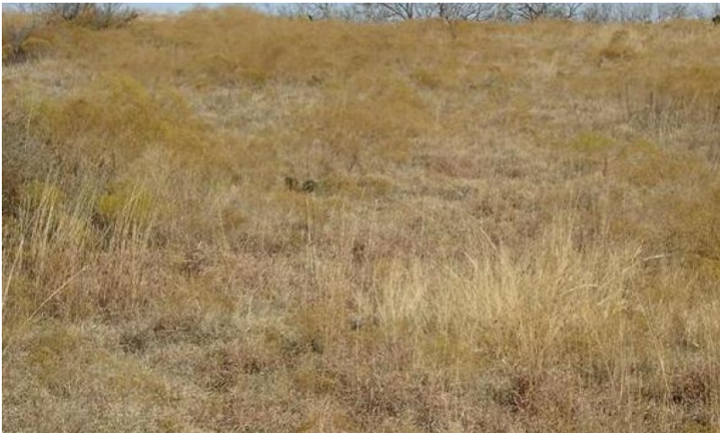
Figure 11. 1.2 Short/Midgrass Prairie Community

Sideoats grama declines because of disturbance or neglect as a result of uncontrolled grazing, lack of fire, climatic factors, or other factors. Shortgrasses such as buffalograss and curlymesquite, dominate the site along with midgrasses such as silver bluestem, dropseeds, and slim and rough tridens. Threeawns and Texas grama increase significantly. More annual grasses and forbs begin to appear on the site. Mesquite, lotebush, pricklypear, and tasajillo begin to invade from adjacent sites and the shrub canopy begins to gradually increase. Annual production ranges from 900 to 2500 pounds per acre.