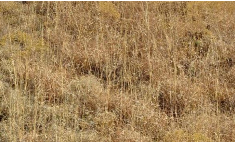
Figure 8. 1.1 Mid/Shortgrass Prairie Community

The reference plant community for the Shallow Clay ecological site is a midgrass/shortgrass prairie. In pristine conditions, the site is dominated by sideoats grama with smaller amounts of cane and silver bluestem, Arizona cottontop, dropseeds, and vine mesquite. Buffalograss, curlymesquite, and hairy grama are sub-dominant shortgrasses. Blue grama is a minor, but significant, part of the historic shortgrass component on this site. Perennial forbs are scattered across the site. Shrubs are a minor component of the plant community. Annual production ranges from 1000 to 2800 pounds per acre.