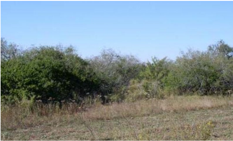
Figure 15. 2.2 Woodland Community

Grazing management has little influence on the woody plants once the threshold is crossed into the Woodland Community (2.2). Live oak with high stem densities composes a significant portion of the woody cover. Mesquite density increases and mottes with an understory of subordinate shrubs, such as granjeno, brasil, and lime prickly-ash have developed. Brush management is necessary to shift the oak or mesquite woodland back to a grassland or parkland. Herbaceous vegetation is scant, and is composed of short grasses and early successional forbs. Prescribed grazing with continued selective brush management and fire will be needed to maintain the parkland.