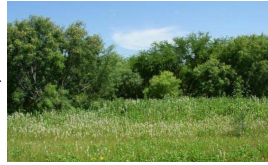
Heavy Canopy Shrub/Woodland

Continued heavy grazing coupled with lack of fire will cause this community to transition to the Heavy Canopy Shrub/Woodland Community (2.2). Brush density and height will continue to increase and shade the ground.