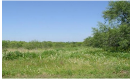
Moderate Canopy Shrubland/Woodland