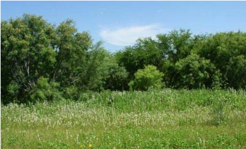
Figure 18. 2.2 Heavy Canopy Shrub/Woodland

In the absence of fire and brush management, a highly stable shrubland or woodland community develops as woody patches increase in abundance and coalesce with each other. Mesquite and acacia overstory plants that dominate the preceding community (2.1) may begin to die due to natural causes, leaving a diverse mixed-shrub community characterized by shrubs such as brasil, lime prickly ash, and spiny hackberry. Woody canopy exceeds 50 percent. Herbaceous plants are primarily composed of native shortgrasses and forbs. Ground cover and herbaceous production beneath shrub canopies is minimal. Aggressive brush management is required to transitions from this state. Prescribed burning may not be possible until woody cover is reduced by herbicides or mechanical treatments to the point that grasses (fine fuels) can establish. Establishment of native grasses is difficult and dependent upon natural seeding from remnant patches, as their seed banks in shrub patches may be depleted.