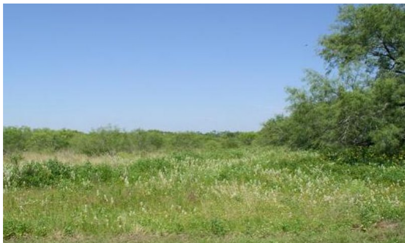
Figure 15. 2.1 Moderate Canopy Shrubland/Woodland