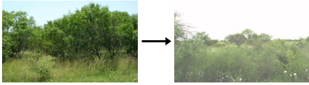
Heavy Canopy Shrub/Woodland