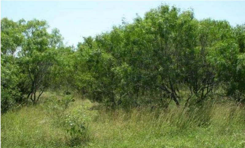
Figure 18. 2.2 Heavy Canopy Shrub/Woodland

This plant community is the culmination of continued heavy grazing and a lack of fire or brush management. At this point the woody species have dominated the site and there is very little understory production. Bare ground has increased and caused crusting to the point that there is little water infiltration and little seedling emergence. Water infiltration does occur directly under some of the woody species, such as mesquite, as it moves down the trunk of the tree to the base. During the growing season, light showers are captured in the canopy of the trees and evaporate. Energy flow is predominantly through the shrubs as is the nutrient uptake. Winter rains can produce understory forage from cool-season annual forbs and grasses and perennials such as Texas wintergrass.