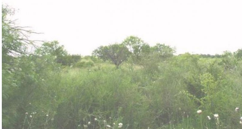
Figure 15. 2.1 Moderate Canopy Shrub/Woodland

This plant community is a result of a transition from the Grassland Savannah (1) to the Shrubland/Woodland State (2). This threshold is passed when the woody canopy becomes such that insufficient fuel is produced to carry a fire that will control the woody canopy. The understory is limited in production due to the competition for sunlight, water, and nutrients. There is an increase in tasajillo, prickly pear ( Opuntia spp.), yucca ( Yucca spp.), annual grasses, and forbs.