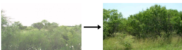
Moderate Canopy Shrub/Woodland