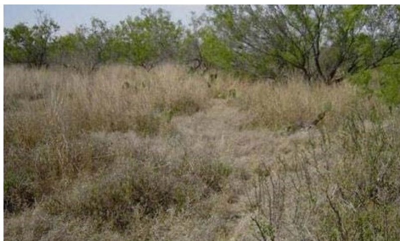
Figure 11. 1.2 Mid/Shortgrass Dominant Community

This plant community develops as abusive grazing continues. Midgrasses such as alkali sacaton, false Rhodesgrass, vine mesquite, and plains bristlegrass decrease in the plant community. Less palatable midgrasses such as white tridens and pappusgrass increase along with increased amounts of curly-mesquite and other shortgrasses. Fire frequency and intensity will decrease allowing woody plants and prickly pear to begin encroaching on the landscape. Woody canopy includes mesquite, lotebush, and guayacan.