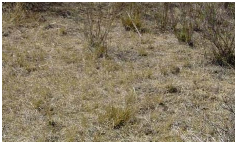
Figure 16. 2.2 Wooded Grassland Community

In community 2.1, midgrasses are limited in volume and may be relegated to growing within thorny shrubs and/or prickly pear. Interspaces between woody plants are dominated by shortgrasses such as curly-mesquite, whorled dropseed, Hall's panicum, and purple three-awn. Fire is a rare occurrence and most likely occurs only following years of abundant rainfall. Honey mesquite and prickly pear are greatly increased along with woody shrubs such as whitebrush, lotebush and guayacan. This state may also be heavily invaded by goldenweed and perennial broomweed, which greatly reduces grass production. These weedy species along with mesquite can be managed with appropriate herbicides allowing grasses to increase and flourish. Herbicidal uses should be followed by prescribed grazing and prescribed burning as needed.